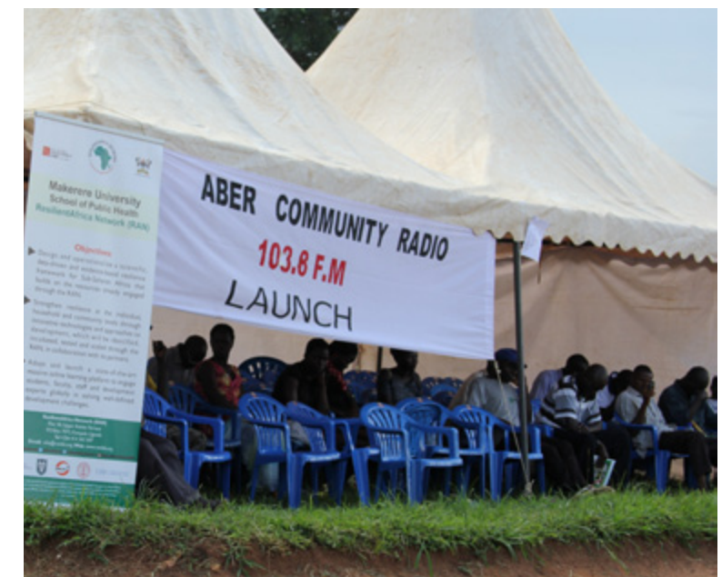
Listening to “tiny FMs” in Northern Uganda (top) is a community affair; Launching Aber Community radio.