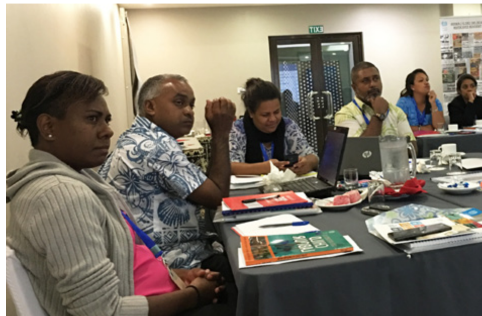
Participants discuss journalism in Fiji at a "Valuing Voices" PJ workshop in Fiji.

Reference: Morris, Ricardo. (2016). 'Journalism of hope': realities in post-election Fiji. Pacific Journalism Review , 22(1), 25-37.