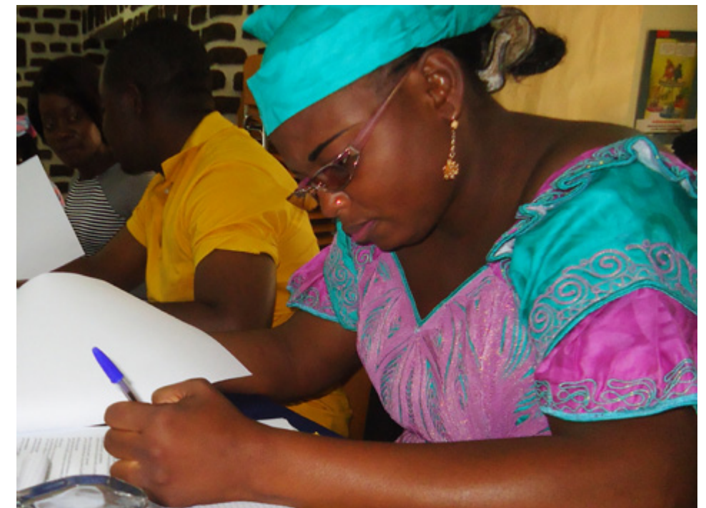
A journalist discusses PJ at a post-seminar press conference in Buea (top), and a participant looks over stories at the Fredrich Ebert foundation in Yaounde.