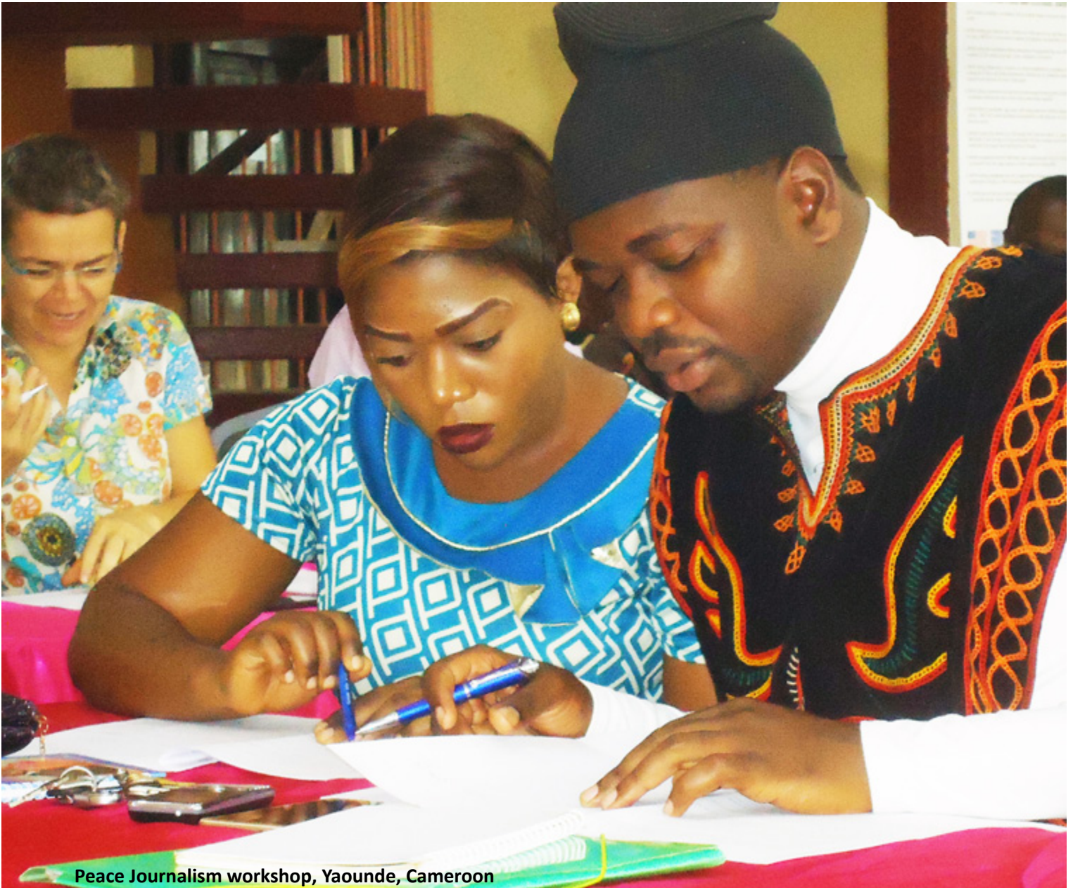
Peace Journalism workshop, Yaounde, Cameroon