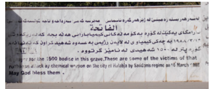
(Top) A mass grave, holding 1500, honors those lost in the gas attack in Iraqi Kurdistan. (Below) A guide at the Halabja Museum, who survived the gas attack as a young boy, gives a first hand account of what happened in 1988.