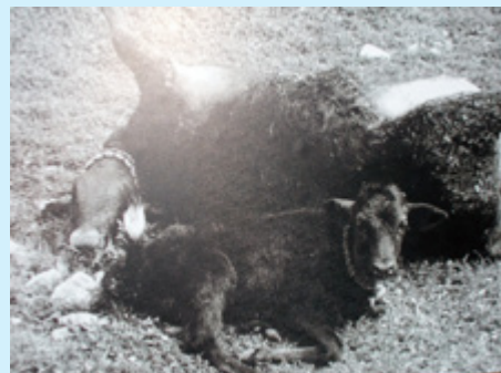
A photo of a dead cow and her calf hangs in the Halabja Muesum in Iraq.

Photographs, even of a most extremely tragic nature, have rarely received more than a fleeting and superficial response from the Western public. Those that do, for instance Kevin Carter's Pulitzer Prize winning photo of the emaciated little Sudanese girl with the vulture hovering behind her, for Westerners, tend to