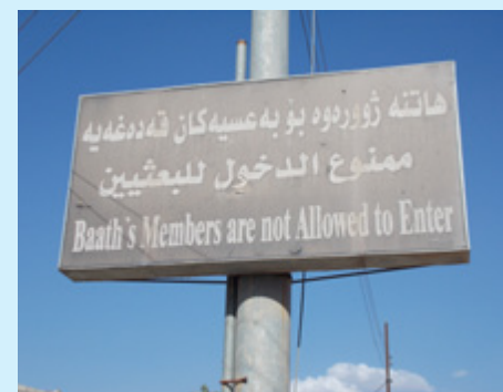
A sign hanging over the Halabja cemetery in Iraqi Kurdistan.

take on the qualities of a commercial logo. In Carter's case, a logo symbolizing the anguish that was Africa at the time. However, what is the point, as even such extreme pathos does not seem able to galvanize a populous to action. Possibly such grim logos do not have the same sales potential for Westerners as the Nike swoosh. I did take one photo in the museum.