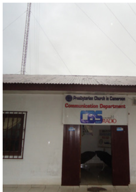
A press scrum in Kumba with Steven Youngblood (top); CBS radio in Buea.

ists stated all) of the aforementioned factors are applicable in Cameroon and that therefore violence – under certain conditions – is most likely to occur during and after the elections.