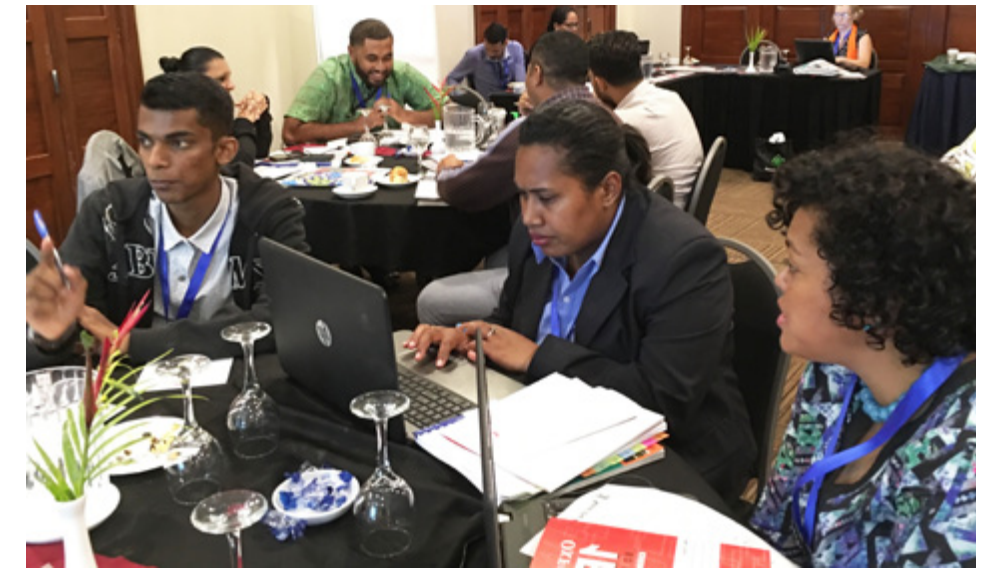
Participants discuss peace journalism at a recent workshop in Fiji.

All stories demonstrated the inclusivity aspect of peace journalism approach by talking to the people who seemed invisible but were affected by the issue. The participants made an effort to gather as many diverse sources of information as possible and interviewed as many people as they could. The story on the climate