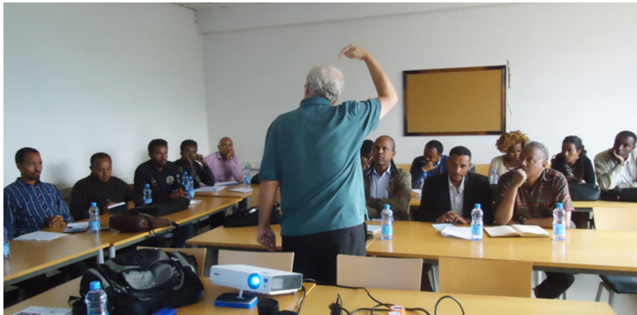
Learning peace journalism at a public forum in Addis Ababa (top left); at Jimma University (top right), and at the University of Addis Ababa.