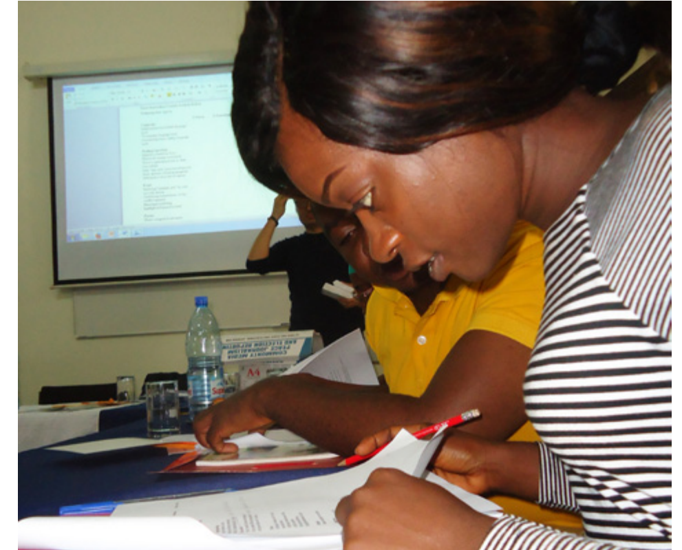
A participant reviews her notes at the Fredrich Ebert foundation in Yaounde.