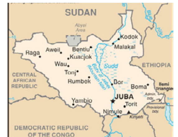
U. Texas Libraries