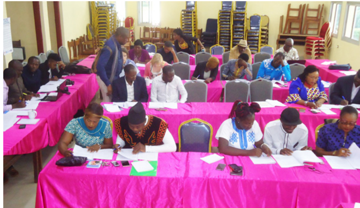
In Bamenda, Cameroon, journalists review stories for PJ content.