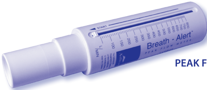
PEAK FLOW METER