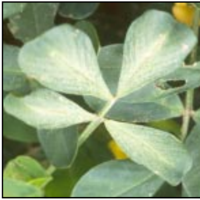
2,4-DB leaf strapping

Specific herbicides with this mode of action include 2,4-D, 2,4-DB, Banvel /Clarity (dicamba), Reclaim (clopypalid), Remedy (triclopyr), and Tordon (picloram).