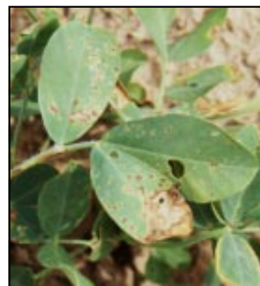
Poast Plus + Crop Oil

yellowing (chlorosis) followed by necrosis (complete tissue death). The meristematic (new growth) region develops a “rotted” appearance which