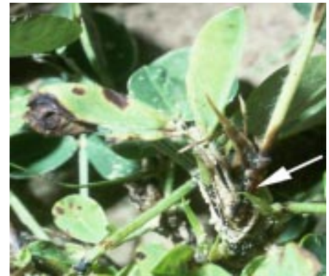
Blackened growth terminal

synthesis inhibitor herbicides are also contained in several premix packages (ex. Canopy, Finesse, Lightning).