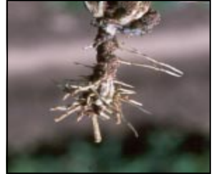
Root stunting caused by DNA herbicides

cides in this group include the class of herbicides known as the “yellows or DNA’s” [Prowl (pendimethalin), Sonalan (ethalfluralin), and Treflan (trifluralin)].