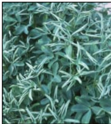
Grazon P+D carryover

Several tank-mix combinations of these herbicides are commonly used in pastures including Weedmaster (2,4-D + dicamba) and Grazon P + D (2,4-D + picloram). Typical injury symptoms of these herbicides include stem curling/twisting and leaf cupping/crinkling. When applications are made at excessive or above labeled rates to peanut plants that are beginning to set pods, they can also cause severe malformations of the pods.