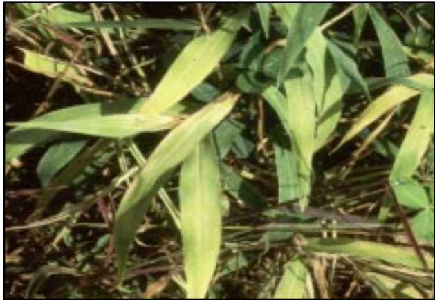
Yellowing caused by lipid synthesis inhibitor

becomes very evident when the leaves are pulled from the whorl of the plant. In some grasses, a reddish-blue pigmentation can be observed.