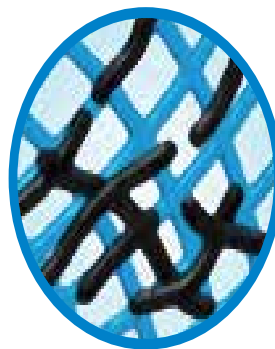
Traditional Silicone products with free silicone fluid molecules

PECORA'S NST SILICONES DO NOT CONTAIN FLUIDS THAT STAIN EFFECTIVELY ELIMINATING STAINING OR RESIDUE RUNDOWN.