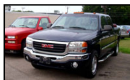
'06 GMC Sierra SLE 4 Door, 4X4! CASH ONLY! $11,500 Stk#497