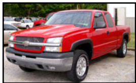
'03 Chevy Z71 4X4, Ext. Cab, Cloth Interior, Super Clean! Stk#587