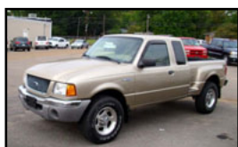
'01 Ford Ranger Ext. Cab, 4X4, Great Truck! Stk#577