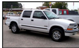
'01 Chevy S10 Crew Cab 4X4, 4.3 V6, Very Nice, Clean Truck! Stk#599