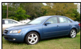
'06 Hyundai Sonata Sunroof, Clean, Super Nice! Stk#550