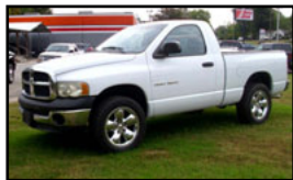
'02 Dodge Ram 1500 Leather, 4X4! CASH ONLY! $8,995 Stk#517