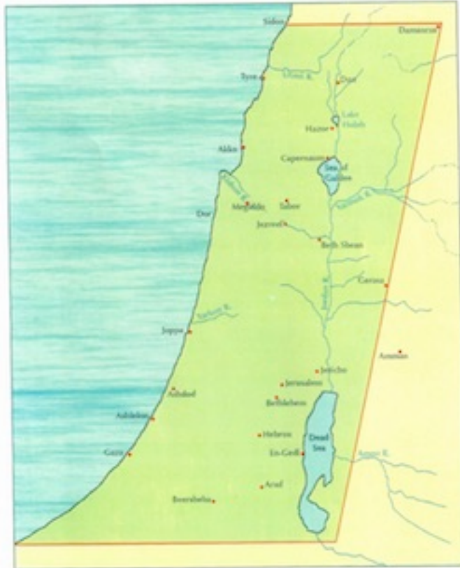
Estimated Map of Messianic Israel by Chaim Clorfene