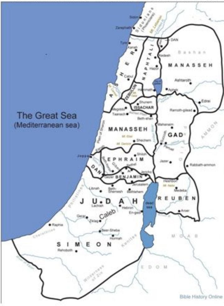
MAP OF CANAAN - TWELVE TRIBE PORTIONS