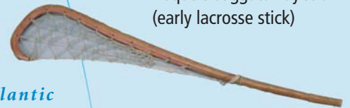
Iroquois baggataway stick (early lacrosse stick)