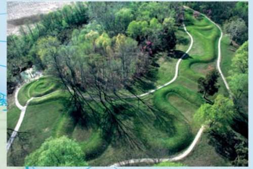
Great Serpent Mound