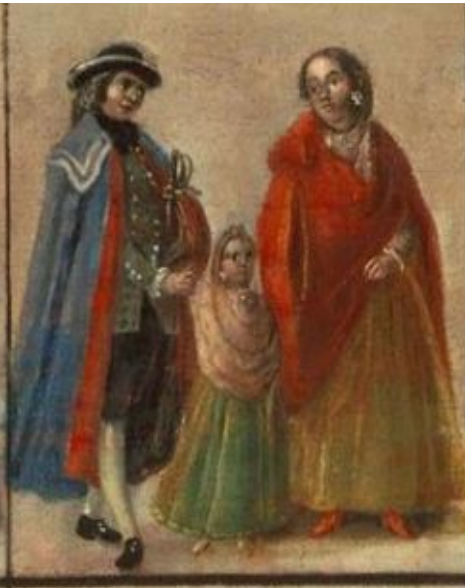
Castizo con Española Español.