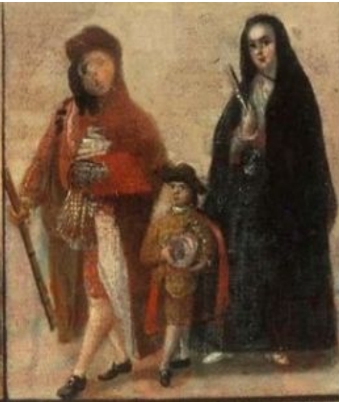
Mestizo con Española Castizo.