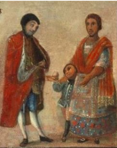
Español con India, Mestizo.