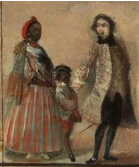
Español con Negra Mulato.