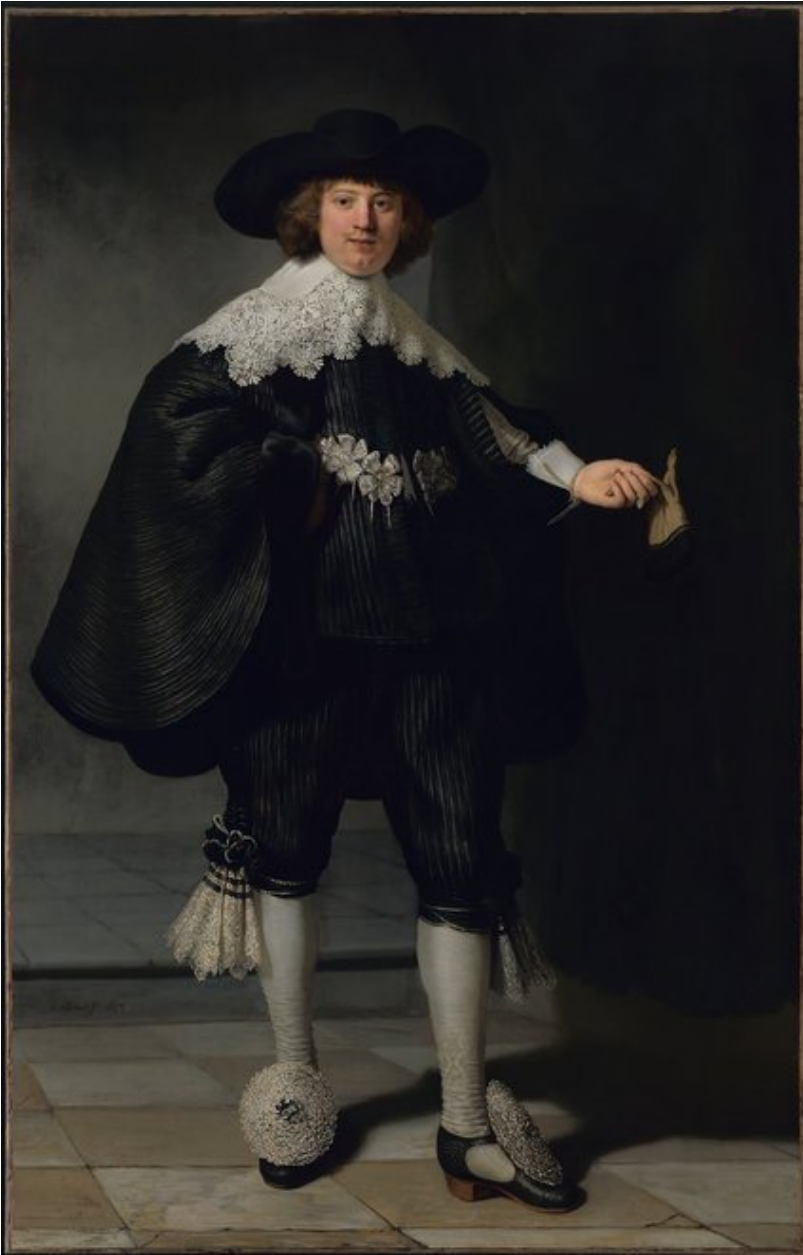
Rembrandt Dutch Baroque 1634 Rijks- museum Amsterdam and Louvre Paris