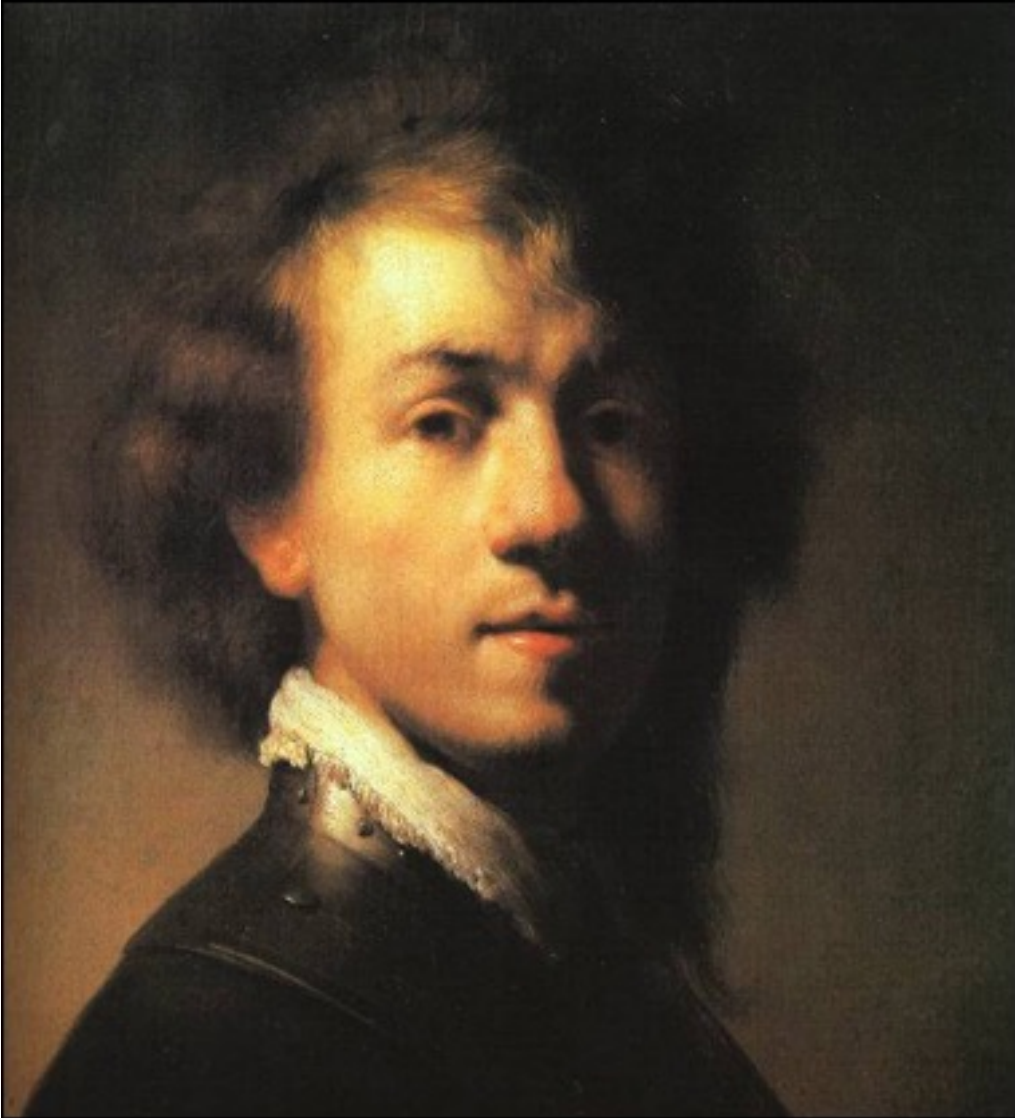
Oil on copper National Museum, Stockholm 1630