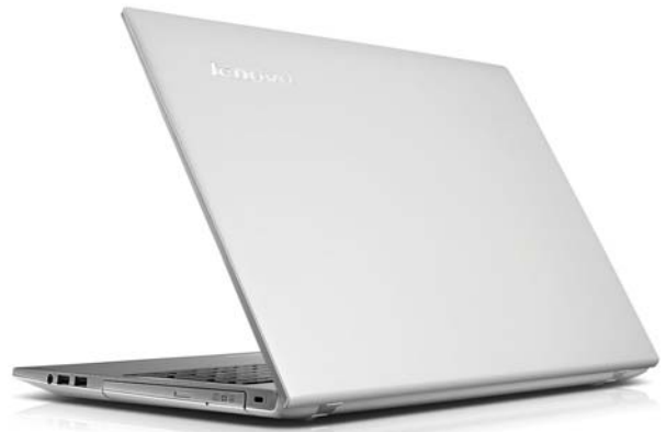
Lenovo IdeaPad Z500 (White)