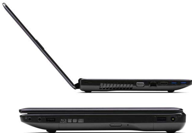
Lenovo IdeaPad Z480 (Graphite gray)