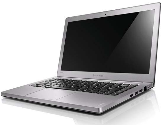
Lenovo IdeaPad U300e (Graphite Gray)