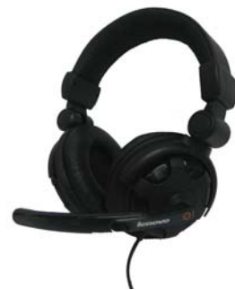
Lenovo Headset P950 (57Y6605)