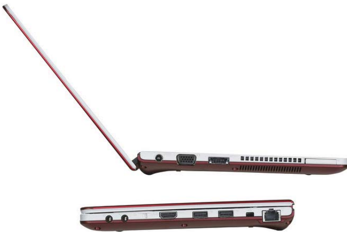
Lenovo IdeaPad U160 red cover