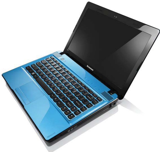
Lenovo IdeaPad Z370 (blue)