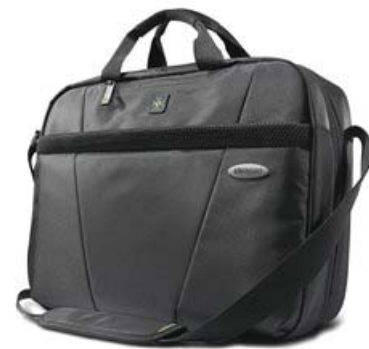
IdeaPad T150 TopLoader (55Y9397)