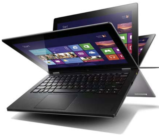
Lenovo IdeaPad Yoga 11 (Silver Gray)