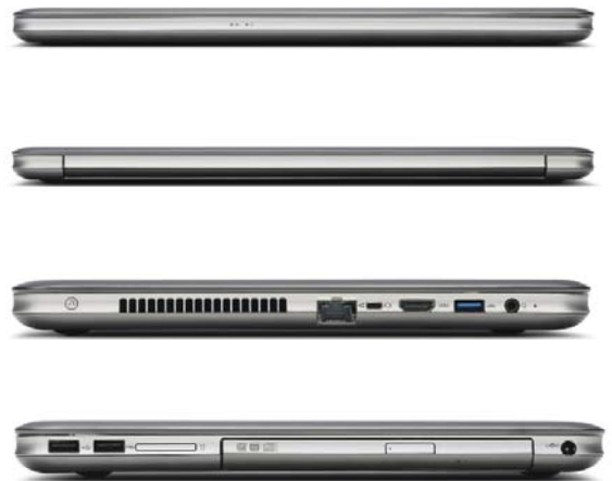
Lenovo IdeaPad U510