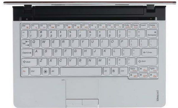
Lenovo IdeaPad U160