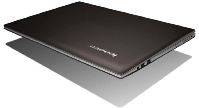
Lenovo IdeaPad Z500 (Dark chocolate)