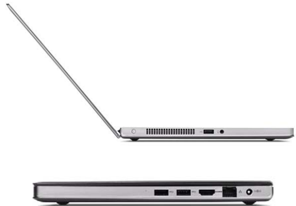
Lenovo IdeaPad U300e (Graphite Gray)