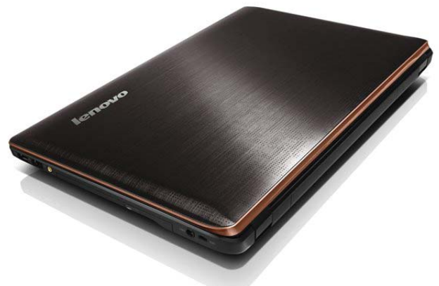
Lenovo IdeaPad Y570