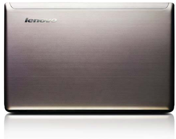
Lenovo IdeaPad Z570