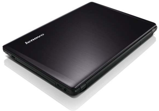
Lenovo IdeaPad Y480 Dark Gray with brushed metal