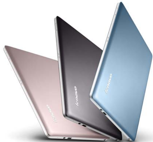
Lenovo IdeaPad U310