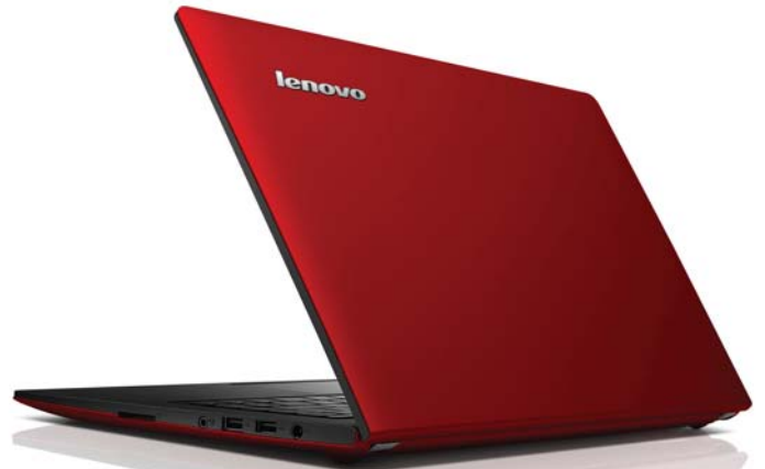
Lenovo IdeaPad S400 (Crimson Red)