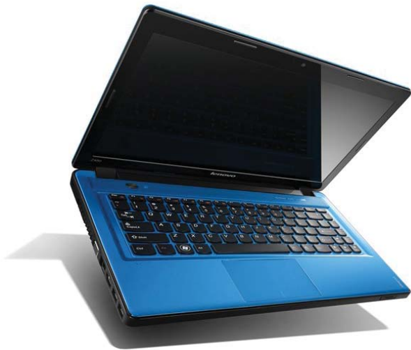
Lenovo IdeaPad Z480 (Coral Blue)