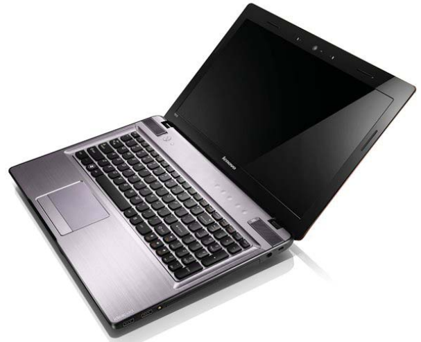
Lenovo IdeaPad Y570