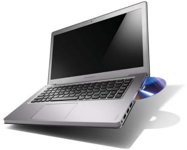
Lenovo IdeaPad U400 (Graphite Gray)