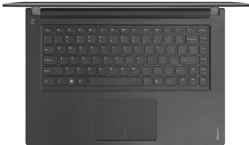
Lenovo IdeaPad S400