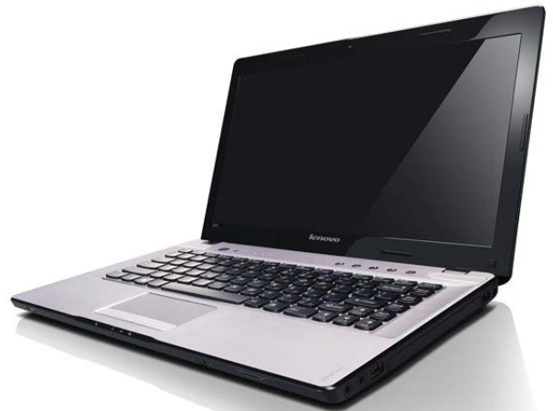
Lenovo IdeaPad Z470