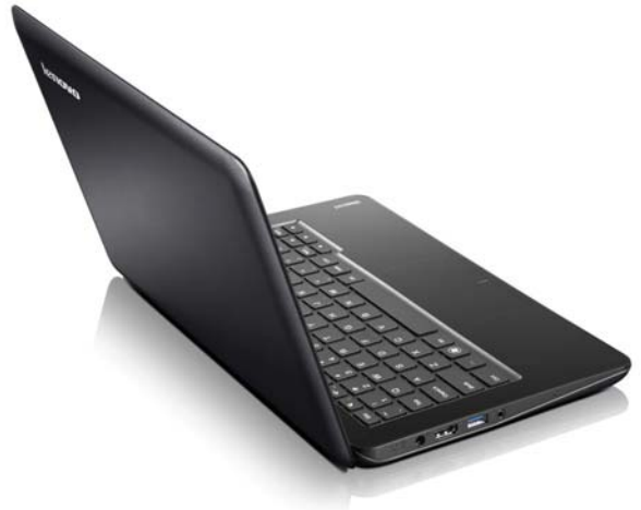
Lenovo IdeaPad S206 (Gray)