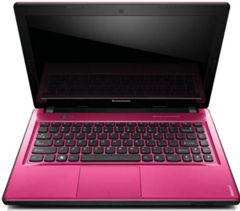
Lenovo IdeaPad Z380 (Peony pink)