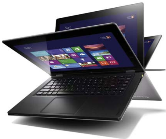
Lenovo IdeaPad Yoga 13 (Silver Gray)