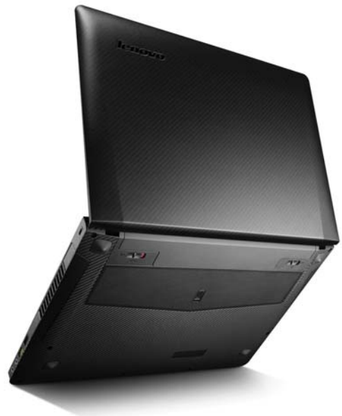
Lenovo IdeaPad Y400 with optional 2 nd fan or 2 nd Graphics