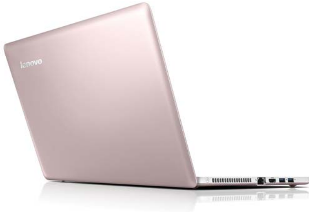
Lenovo IdeaPad U310 (Cherry Blossom Pink)