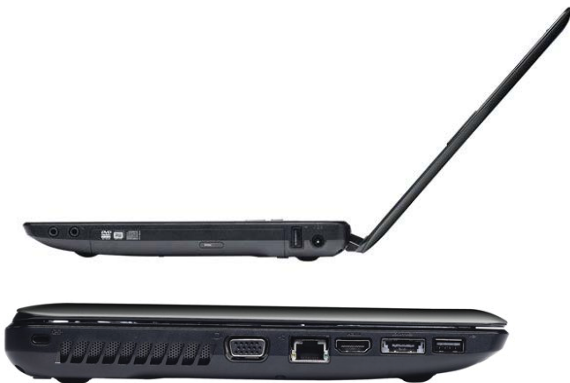
Lenovo IdeaPad Z370 (black)