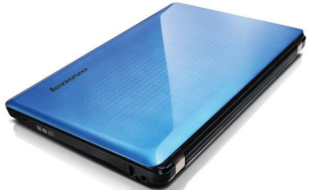
Lenovo IdeaPad Z370 (blue)