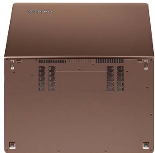
Lenovo IdeaPad U260 Mocha Brown cover