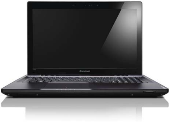
Lenovo IdeaPad Y580