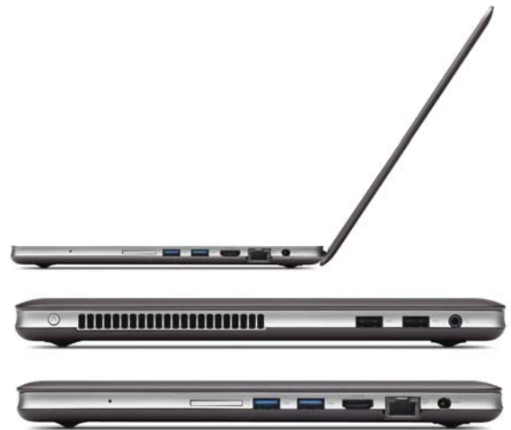
Lenovo IdeaPad U410