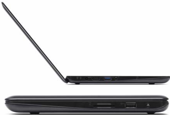
Lenovo IdeaPad S206 (Gray)