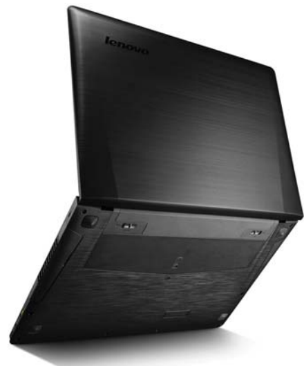
Lenovo IdeaPad Y500 with optional 2 nd fan or 2 nd Graphics