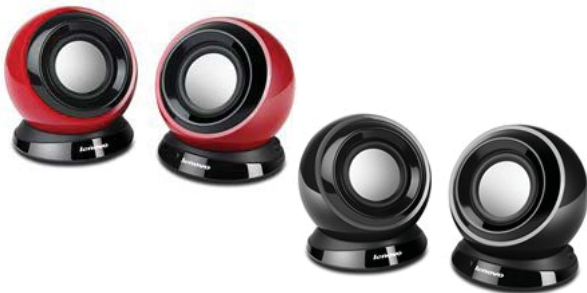
Lenovo Speaker M0520 Black (57Y6360) Lenovo Speaker M0520 Red (57Y6361)