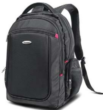
Lenovo 15' Backpack B5650 (57Y6457)