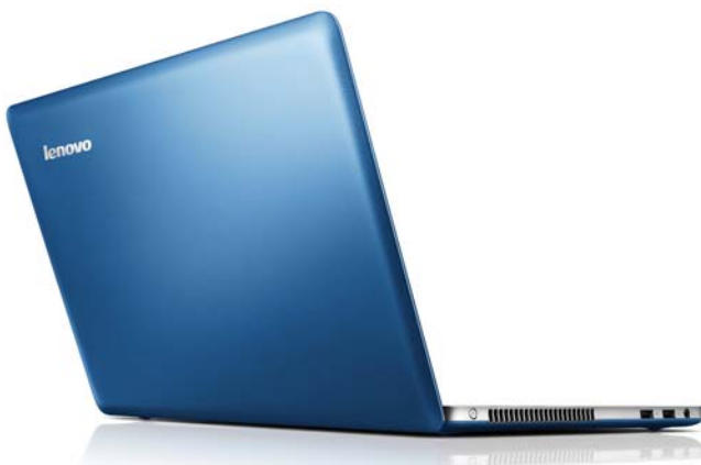
Lenovo IdeaPad U410 (Sapphire Blue)