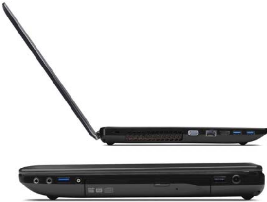
Lenovo IdeaPad Y580