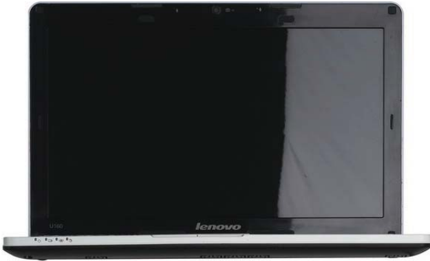
Lenovo IdeaPad U160