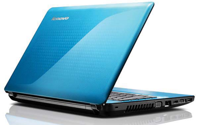
Lenovo IdeaPad Z470