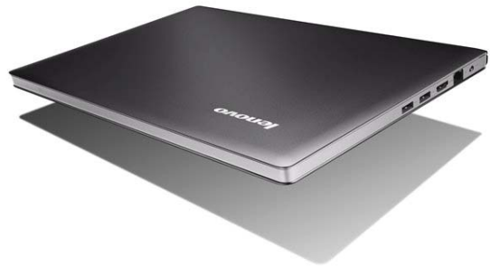
Lenovo IdeaPad U300e (Graphite Gray)