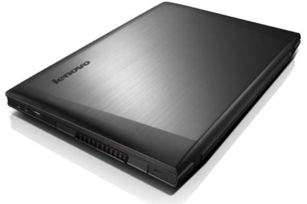
Lenovo IdeaPad Y500 with optional 2 nd fan or 2 nd Graphics