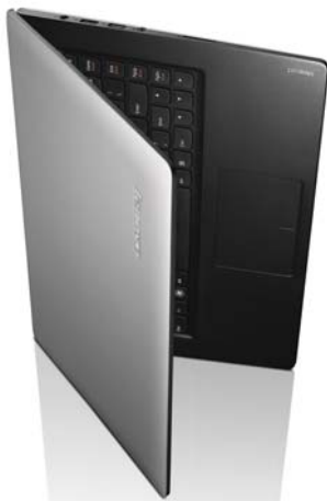
Lenovo IdeaPad S400 (Silver Gray)