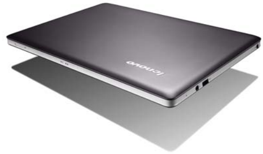
Lenovo IdeaPad U310 (Graphite Gray)