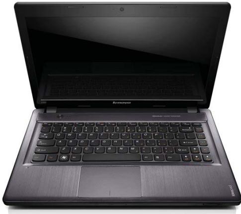
Lenovo IdeaPad Z480 (Graphite Gray)