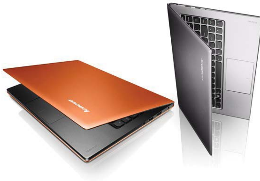
Lenovo IdeaPad U300s

Visit www.lenovo.com/psref for the latest version