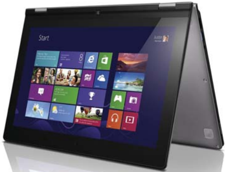
Lenovo IdeaPad Yoga 13 (Silver Gray)