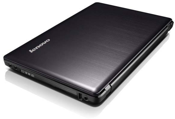
Lenovo IdeaPad Z380 (Graphite gray)