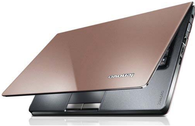
Lenovo IdeaPad U260 Mocha Brown cover