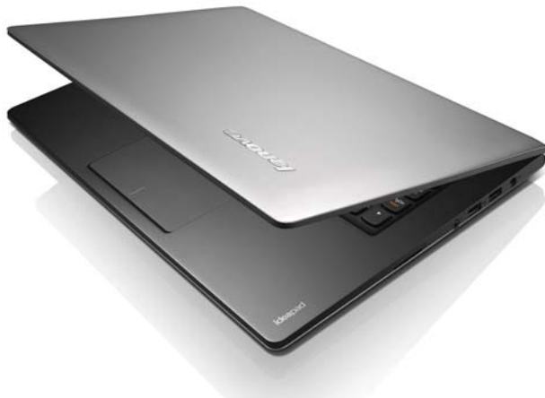
Lenovo IdeaPad S30 (Silver Gray)