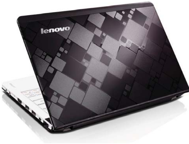
Lenovo IdeaPad U160 black cover