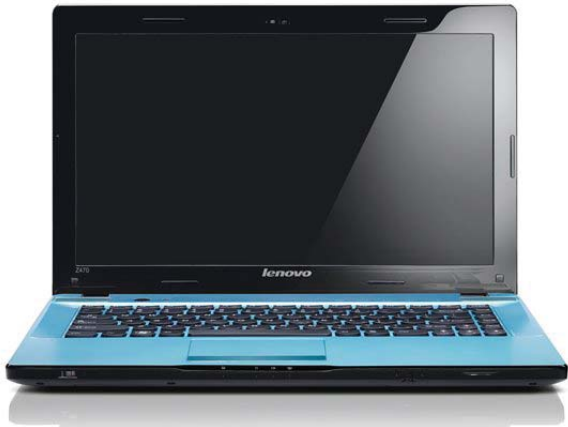
Lenovo IdeaPad Z470