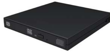
Lenovo Portable DVD Burner DB50 (57Y6487)