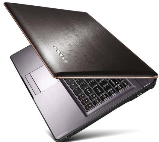
Lenovo IdeaPad Y470