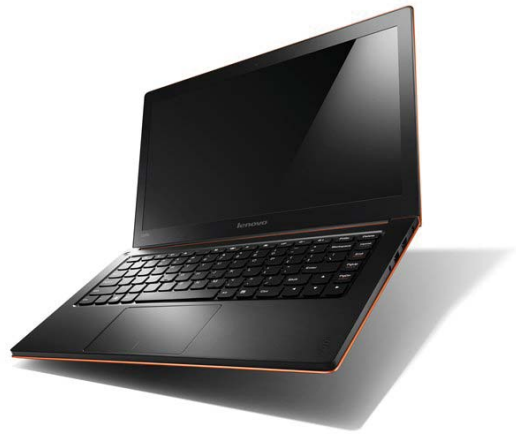
Lenovo IdeaPad U300s (Clementine Orange)