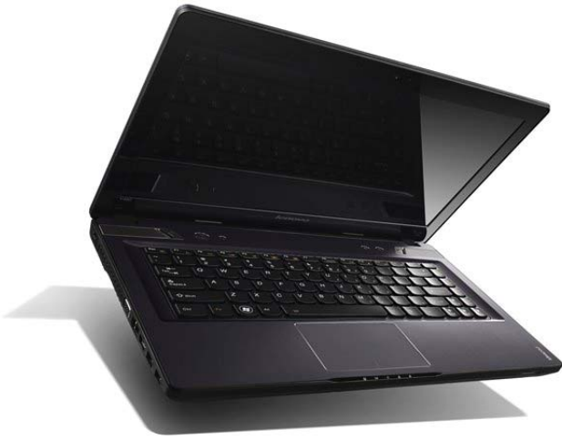
Lenovo IdeaPad Y480