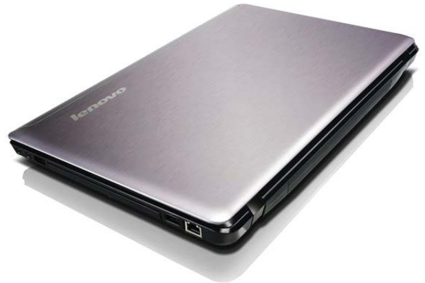
Lenovo IdeaPad Z570