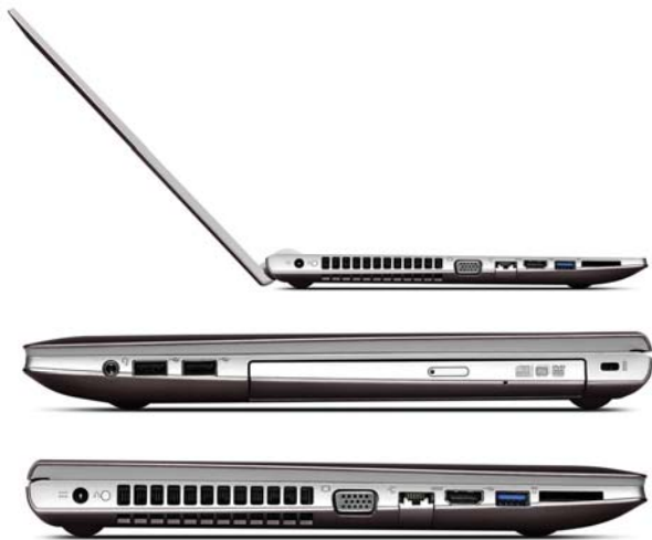
Lenovo IdeaPad Z400 (Dark chocolate)