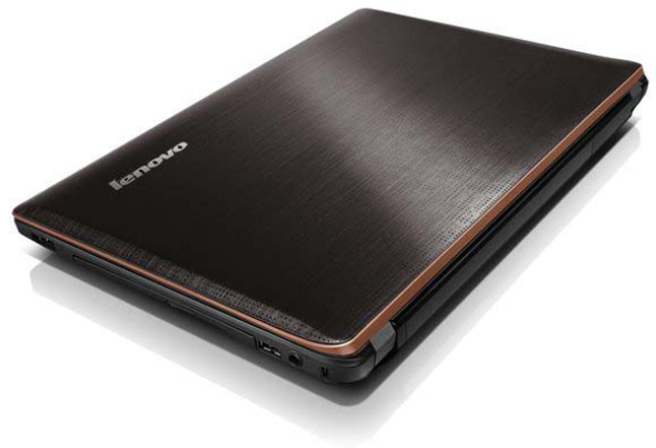
Lenovo IdeaPad Y470