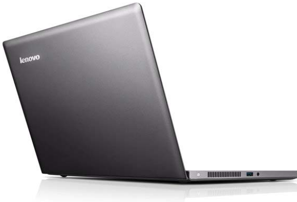
Lenovo IdeaPad U300e (Graphite Gray)