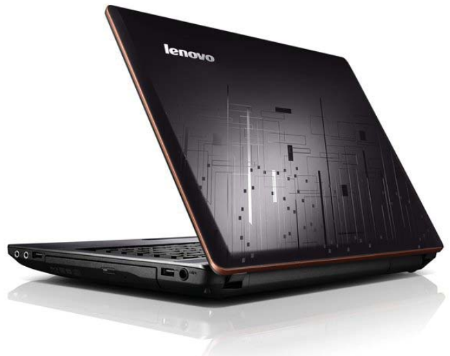
Lenovo IdeaPad Y480 Dark Gray with pattern