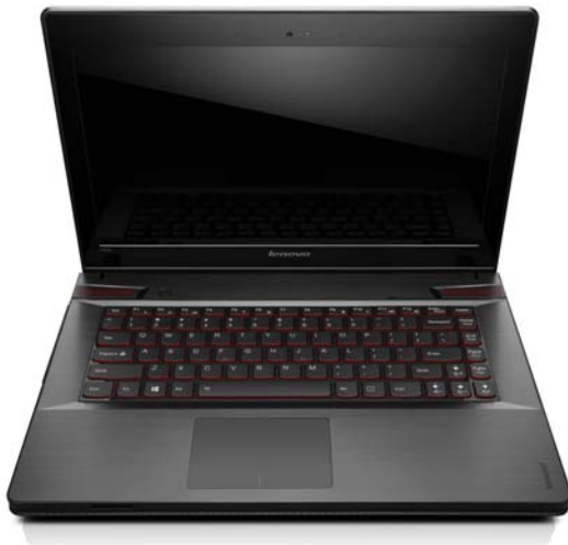
Lenovo IdeaPad Y400 with optional backlight keyboard