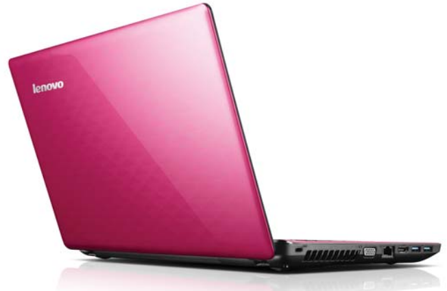
Lenovo IdeaPad Z380 (Peony pink)