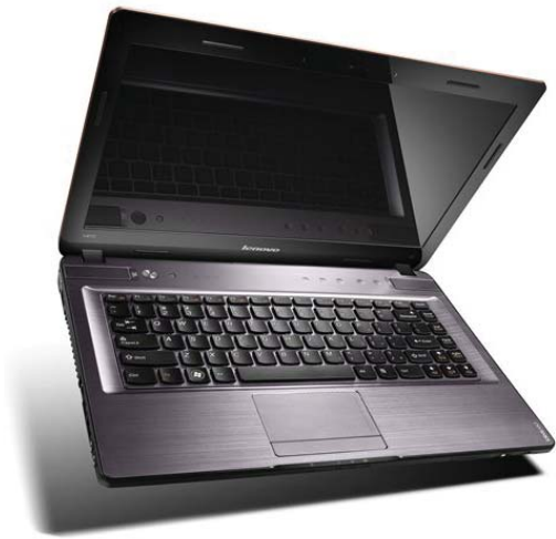
Lenovo IdeaPad Y470