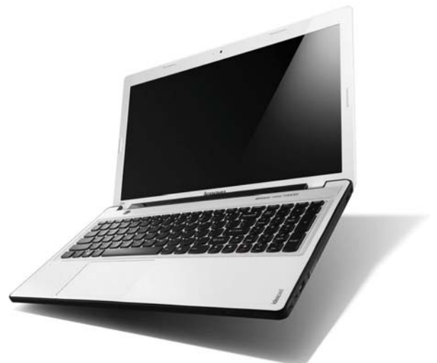
Lenovo IdeaPad Z580 (Enamel white)