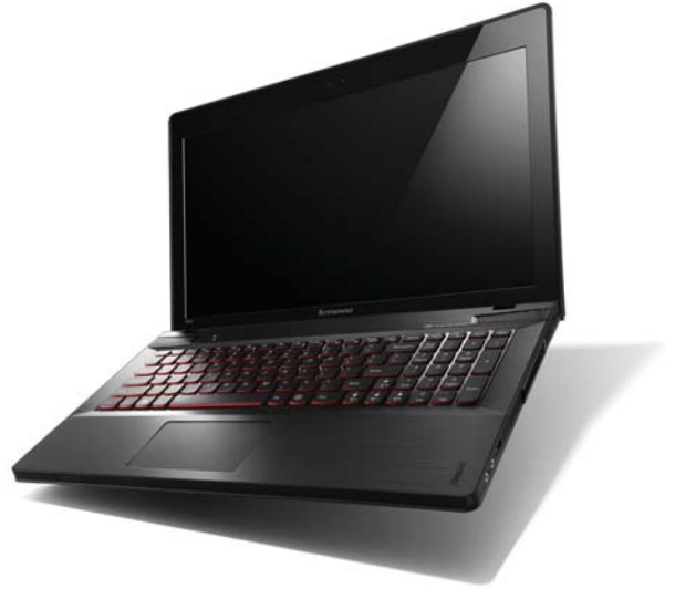
Lenovo IdeaPad Y500