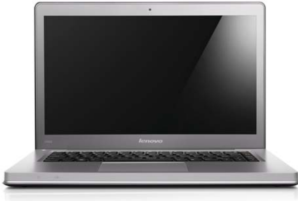
Lenovo IdeaPad U400 (Graphite Gray)