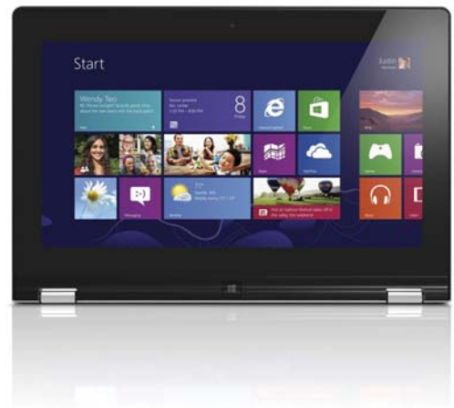
Lenovo IdeaPad Yoga 11 (Silver Gray)