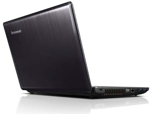
Lenovo IdeaPad Y580