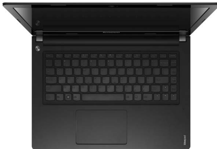
Lenovo IdeaPad 300