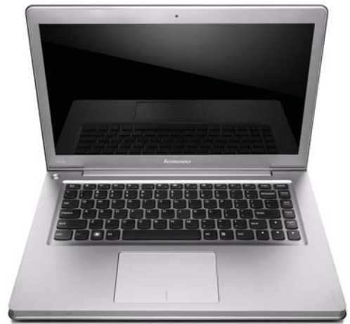
Lenovo IdeaPad U400 (Graphite Gray)