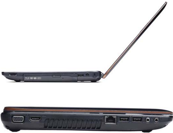
Lenovo IdeaPad Y470