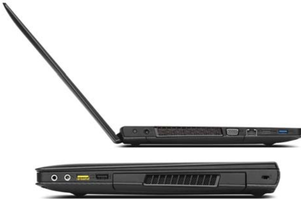
Lenovo IdeaPad Y400 with optional 2 nd fan or 2 nd Graphics