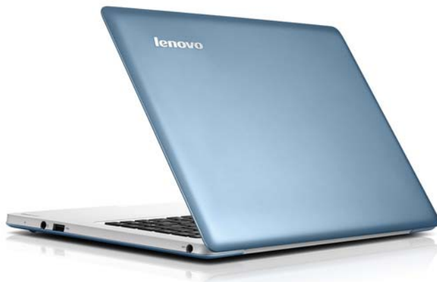
Lenovo IdeaPad U310 (Aqua Blue)