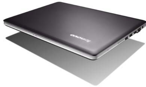
Lenovo IdeaPad U410 (Graphite Gray)