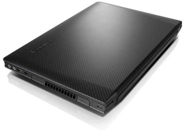
Lenovo IdeaPad Y400 with optional 2 nd fan or 2 nd Graphics