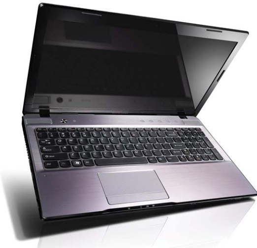
Lenovo IdeaPad Z570