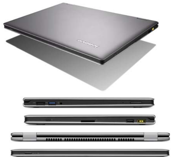
Lenovo IdeaPad Yoga 13 (Silver Gray)