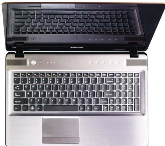
Lenovo IdeaPad Y570