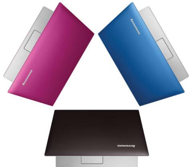
Lenovo IdeaPad Z400