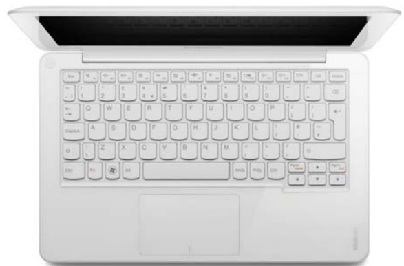
Lenovo IdeaPad S206 (White)