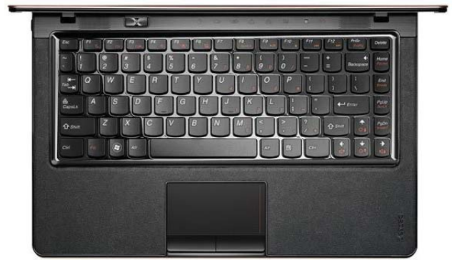
Lenovo IdeaPad U260