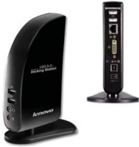
Lenovo Video Docking VDK8726 (57Y6576)