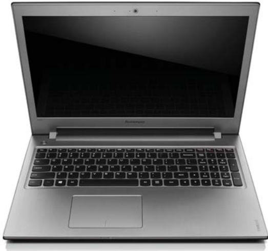
Lenovo IdeaPad Z500 (Dark chocolate)