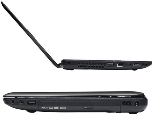
Lenovo IdeaPad Z470