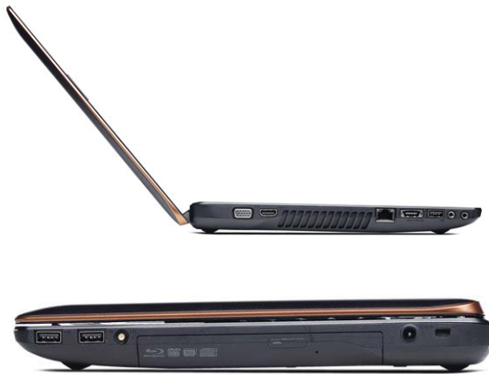
Lenovo IdeaPad Y570