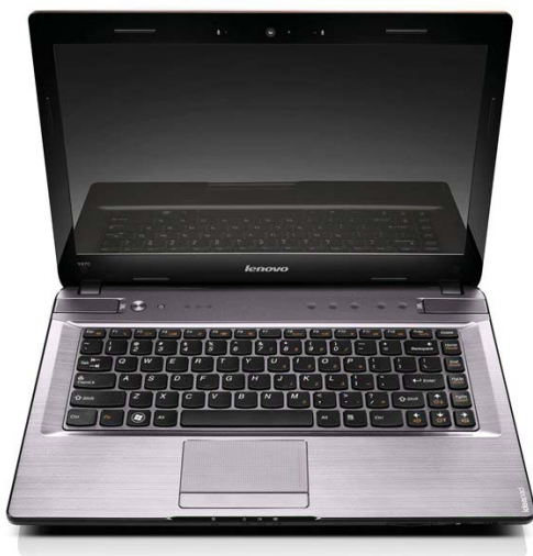
Lenovo IdeaPad Y470