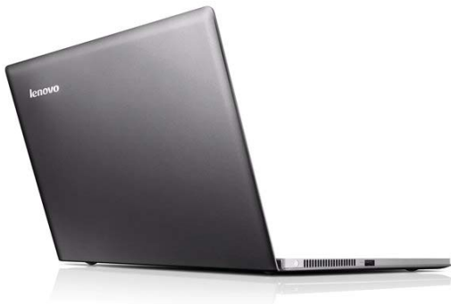
Lenovo IdeaPad U300s (Graphite Gray)