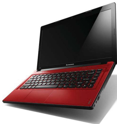
Lenovo IdeaPad Z480 (Cherry Red)