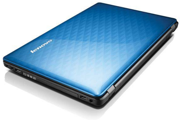
Lenovo IdeaPad Z480 (Coral Blue)