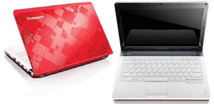
Lenovo IdeaPad U160 red cover