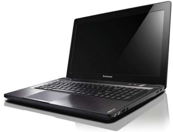
Lenovo IdeaPad Y580