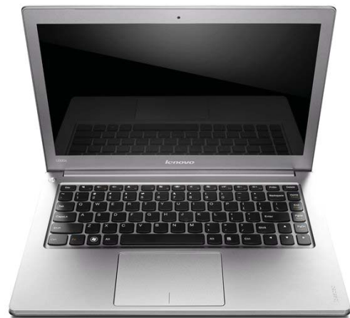
Lenovo IdeaPad U300s (Graphite Gray)