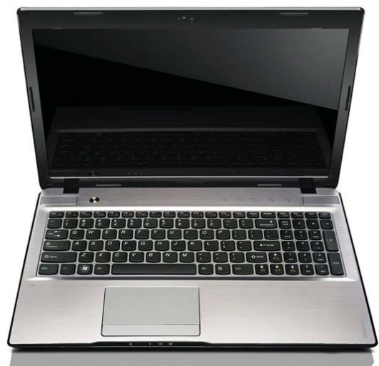
Lenovo IdeaPad Z570