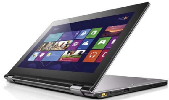
Lenovo IdeaPad Yoga 11 (Silver Gray)