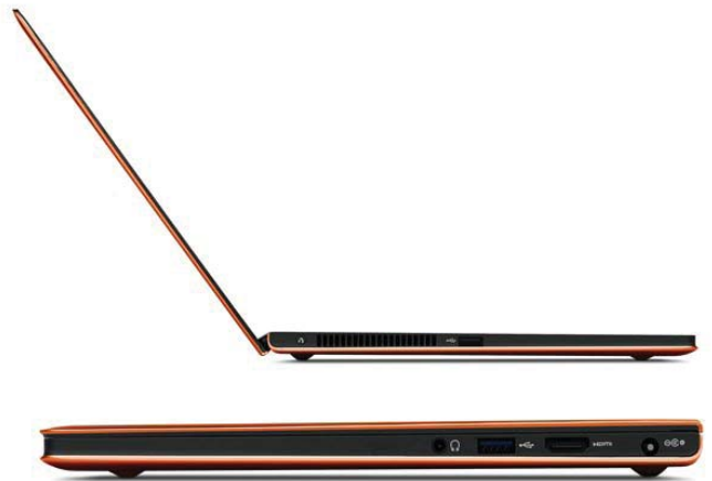
Lenovo IdeaPad U300s (Clementine Orange)