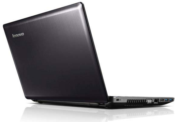
Lenovo IdeaPad Z480 (Graphite Gray)