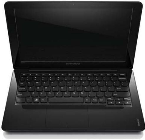
Lenovo IdeaPad S206 (Gray)