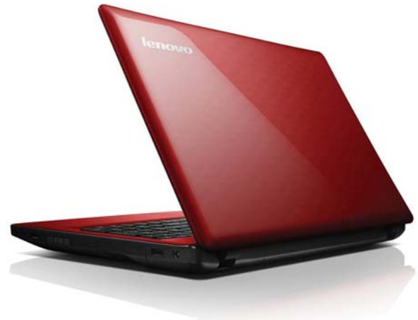
Lenovo IdeaPad Z580 (Cherry red)