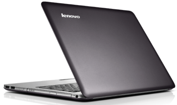
Lenovo IdeaPad U510 (Graphite Gray)