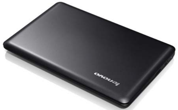
Lenovo IdeaPad S206 (Gray)