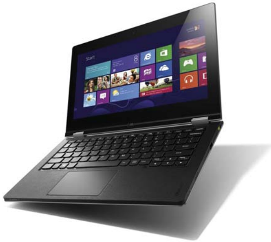
Lenovo IdeaPad Yoga 11 (Silver Gray)