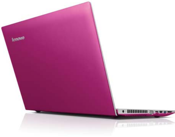
Lenovo IdeaPad Z400 (Pink)