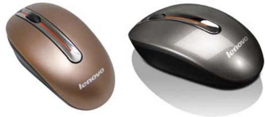
Wireless Mouse N3903A Metal (57Y6596) Wireless Mouse N3903A Coffee (57Y6666)