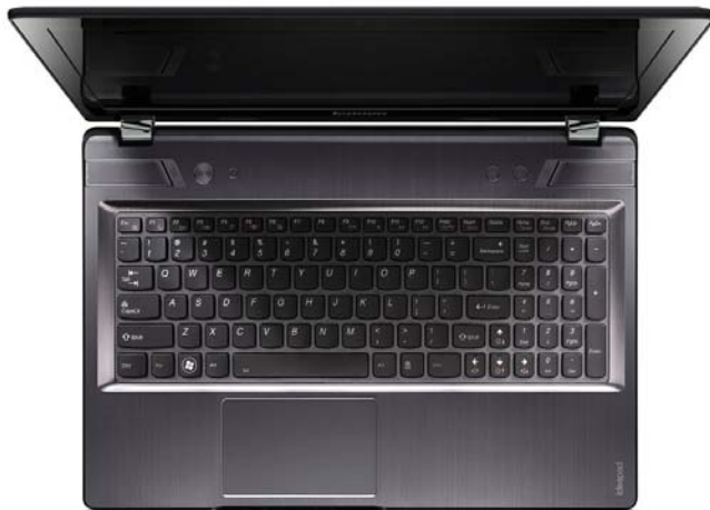
Lenovo IdeaPad Y580