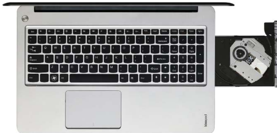
Lenovo IdeaPad U510