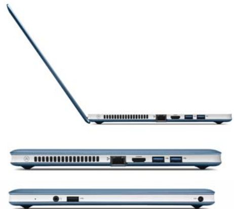
Lenovo IdeaPad U310 (Aqua Blue)