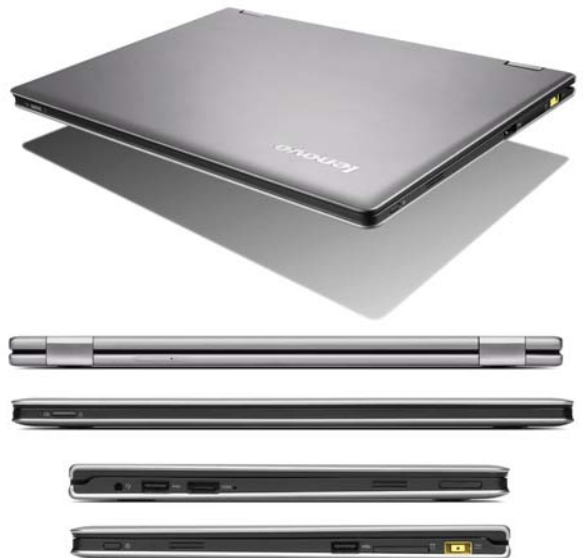
Lenovo IdeaPad Yoga 11 (Silver Gray)