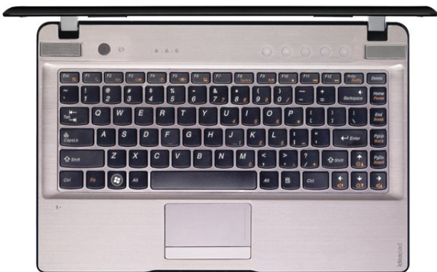
Lenovo IdeaPad Z470