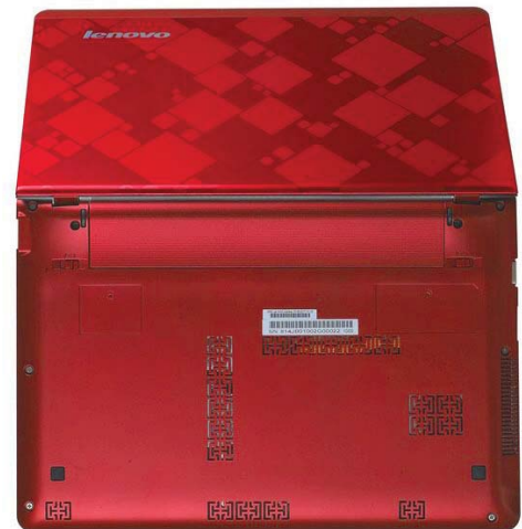
Lenovo IdeaPad U160 red cover