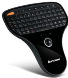
Lenovo Wireless Keyboard N5901 (57Y6336)