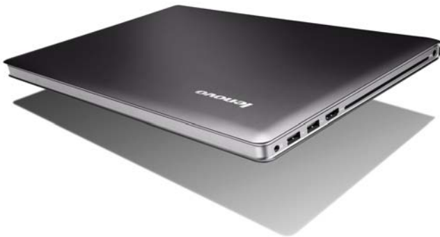
Lenovo IdeaPad U400 (Graphite Gray)