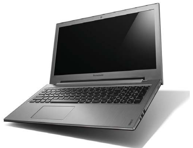
Lenovo IdeaPad Z500 (Dark chocolate)