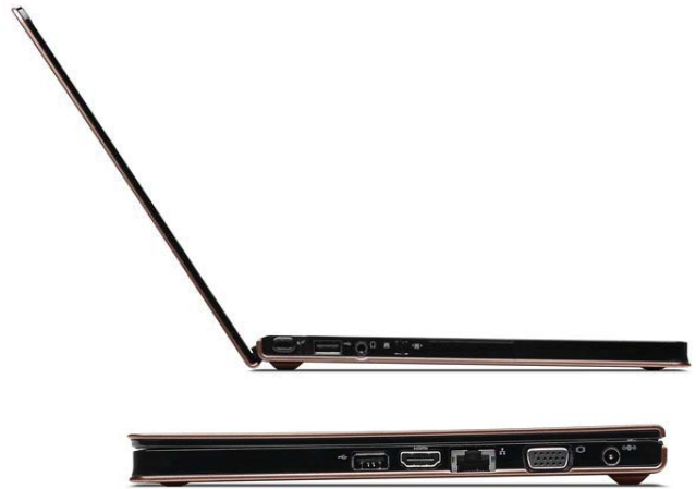
Lenovo IdeaPad U260 Mocha Brown cover