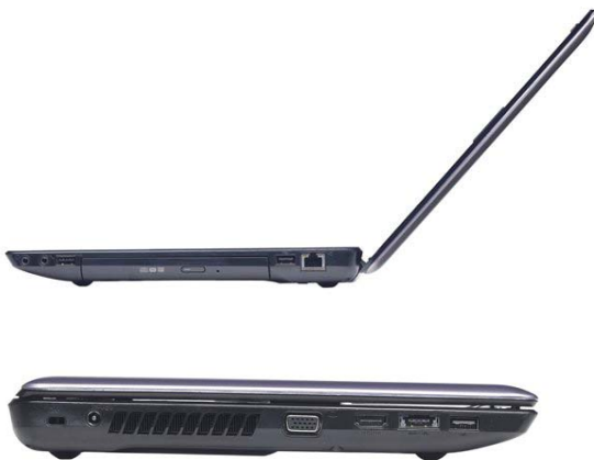
Lenovo IdeaPad Z570