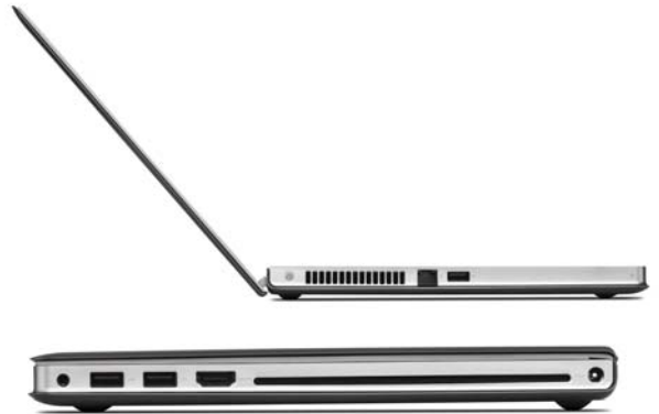
Lenovo IdeaPad U400 (Graphite Gray)