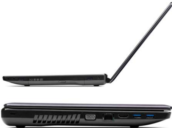
Lenovo IdeaPad Z580 (Graphite gray)