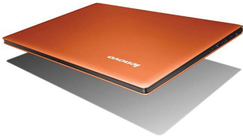
Lenovo IdeaPad U300s (Clementine Orange)