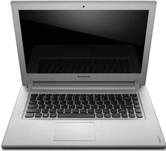
Lenovo IdeaPad Z400 (Dark chocolate)