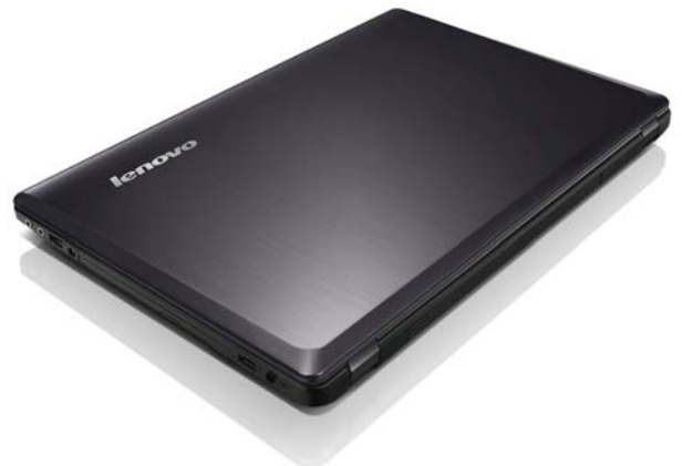
Lenovo IdeaPad Y580