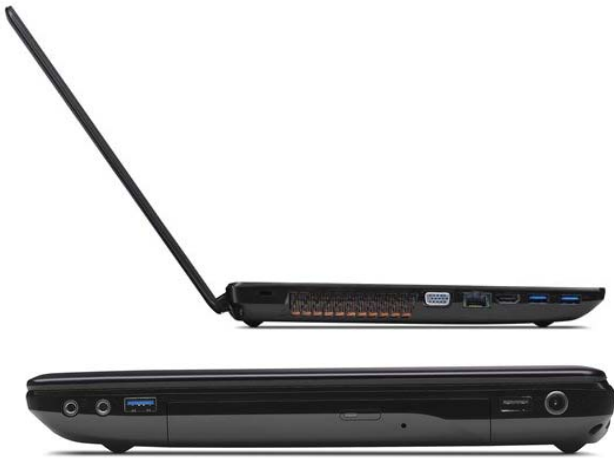
Lenovo IdeaPad Y480 with 3 USB 3.0 and 1 USB 2.0