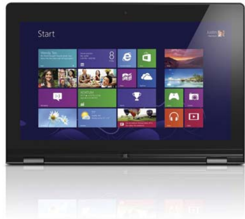
Lenovo IdeaPad Yoga 13 (Silver Gray)