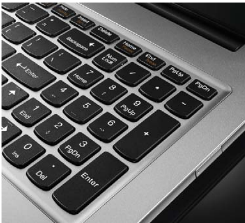
Lenovo IdeaPad U510