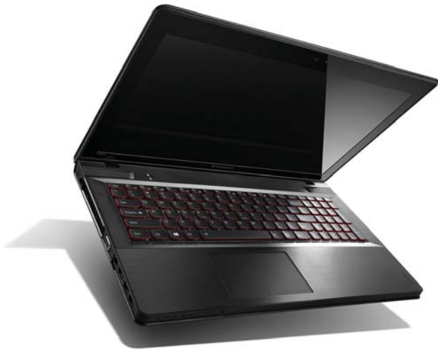
Lenovo IdeaPad Y500