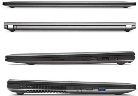
Lenovo IdeaPad S30