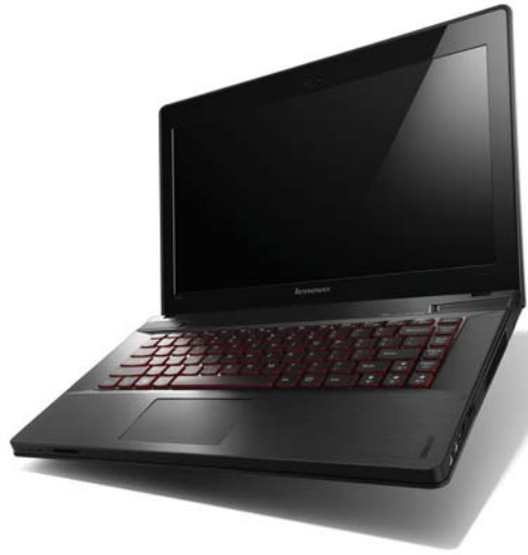
Lenovo IdeaPad Y400 with optional backlight keyboard