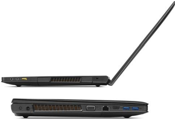
Lenovo IdeaPad Y500 with optional 2 nd fan or 2 nd Graphics