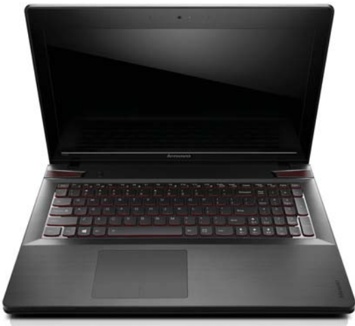
Lenovo IdeaPad Y500