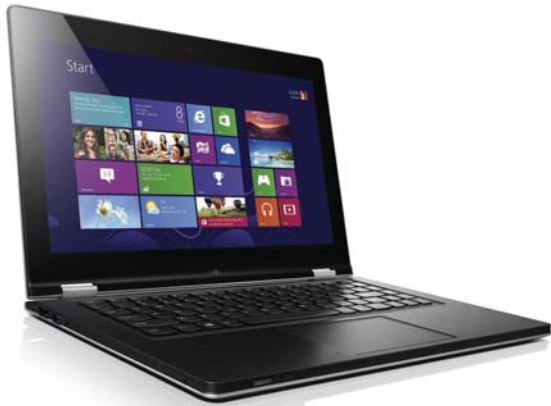
Lenovo IdeaPad Yoga 13 (Silver Gray)