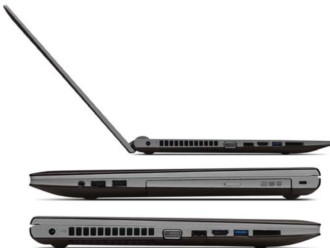
Lenovo IdeaPad Z500 (Dark chocolate)