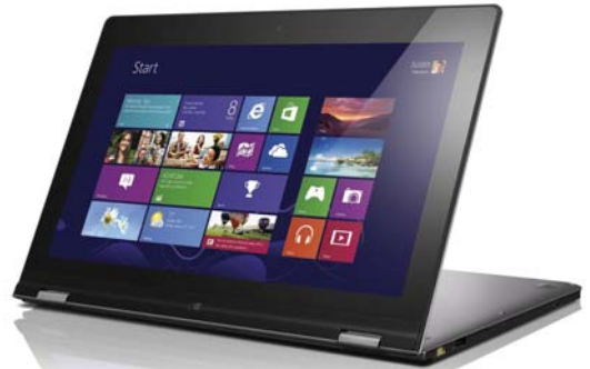
Lenovo IdeaPad Yoga 13 (Silver Gray)