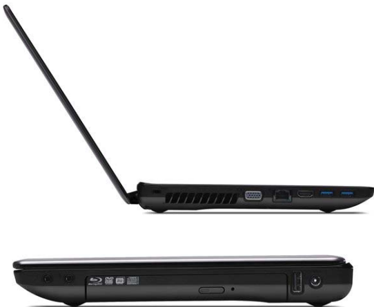
Lenovo IdeaPad Z380 (Graphite gray)