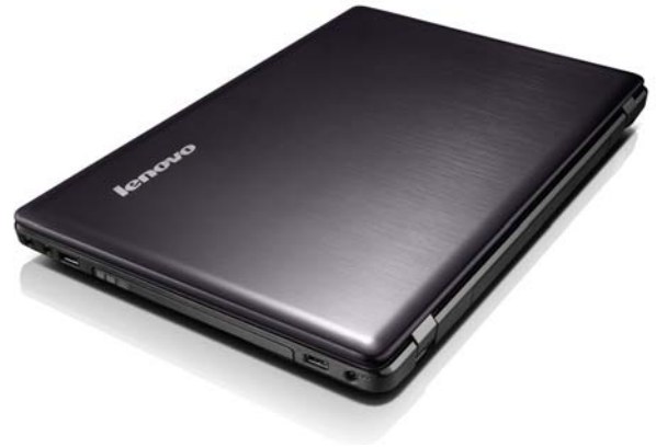
Lenovo IdeaPad Z580 (Graphite gray)