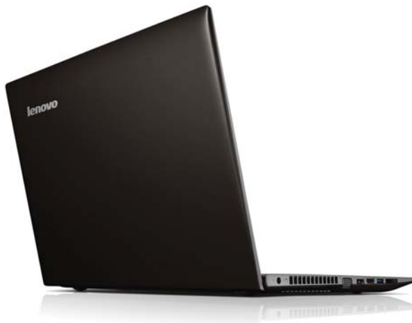
Lenovo IdeaPad Z500 (Dark chocolate)