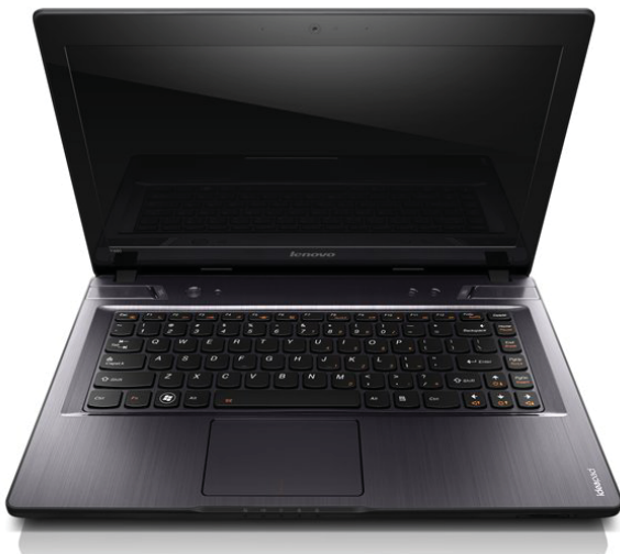
Lenovo IdeaPad Y480