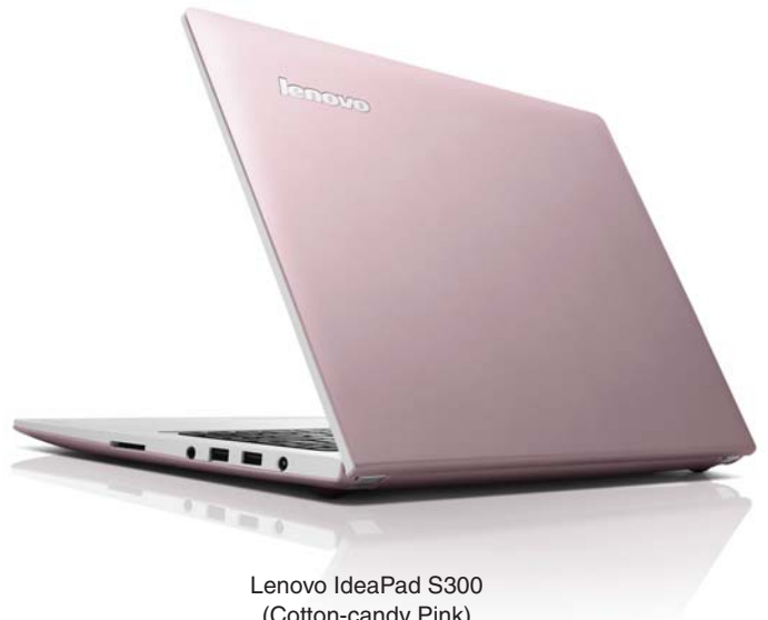
Lenovo IdeaPad S30 (Cotton-candy Pink)