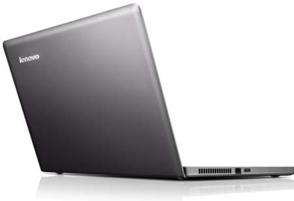
Lenovo IdeaPad U400 (Graphite Gray)