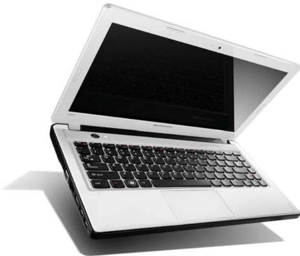
Lenovo IdeaPad Z380 (Enamel white)