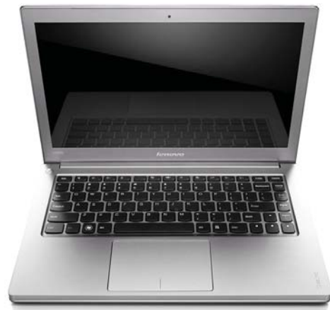
Lenovo IdeaPad U300e (Graphite Gray)