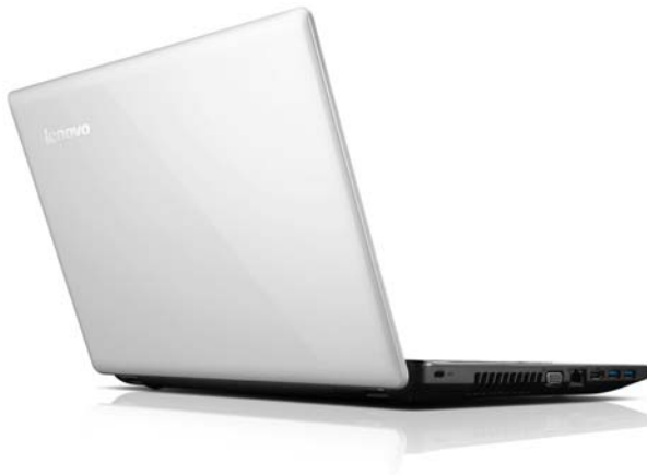
Lenovo IdeaPad Z580 (Enamel white)