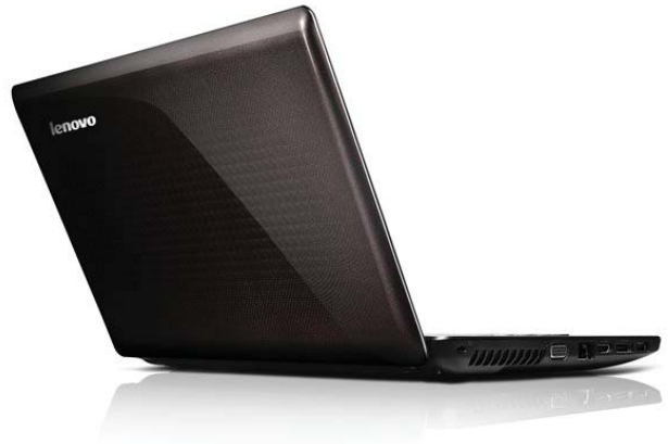
Lenovo IdeaPad Z370 (black)