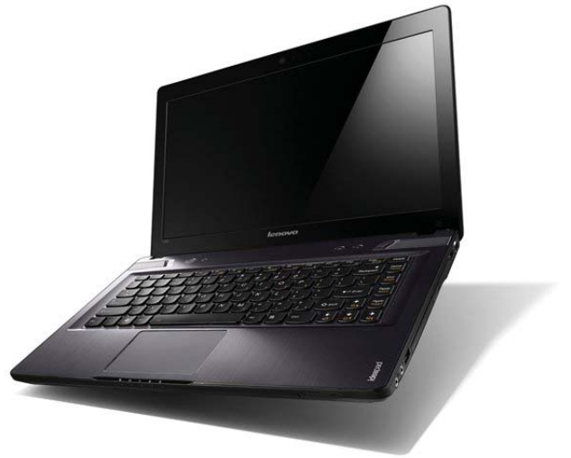
Lenovo IdeaPad Y480