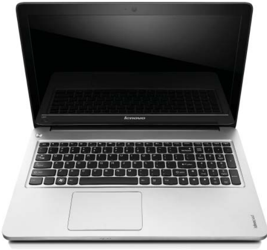
Lenovo IdeaPad U510 (Graphite Gray)