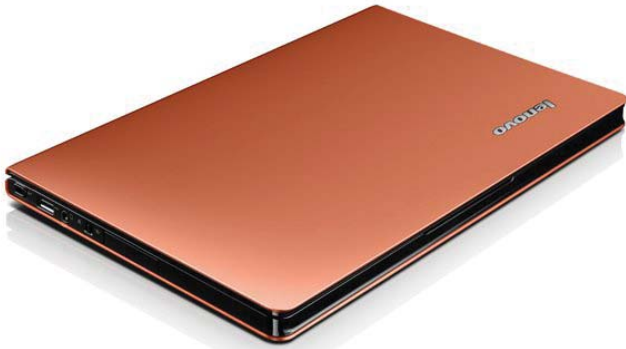
Lenovo IdeaPad U260 Clementine Orange cover