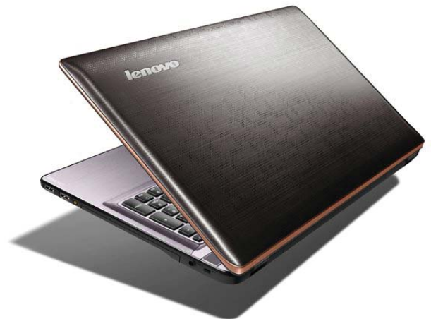
Lenovo IdeaPad Y570