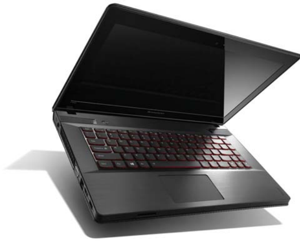
Lenovo IdeaPad Y400 with optional backlight keyboard