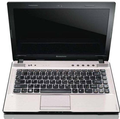
Lenovo IdeaPad Z370 (black)