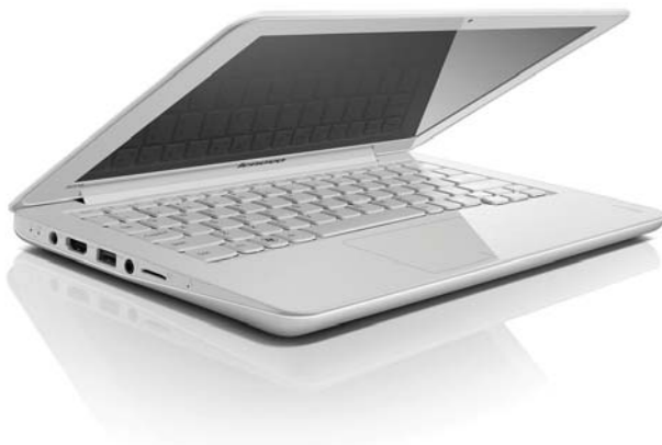
Lenovo IdeaPad S206 (White)