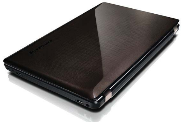
Lenovo IdeaPad Z470