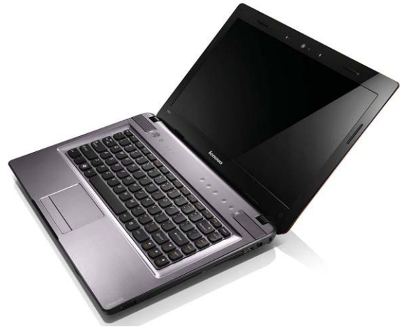
Lenovo IdeaPad Y470