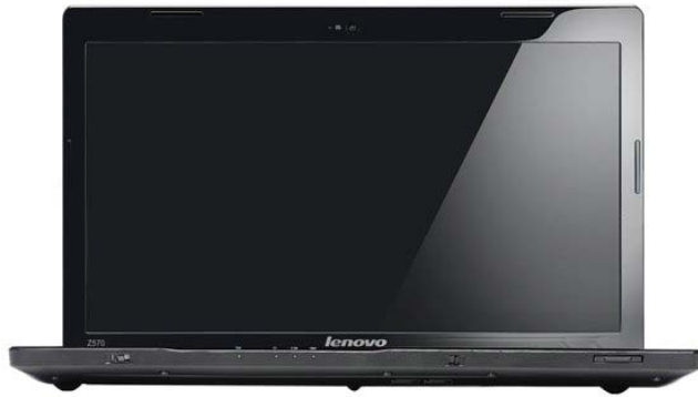
Lenovo IdeaPad Z570