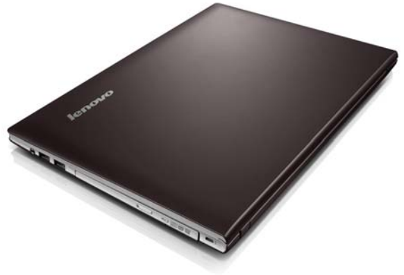
Lenovo IdeaPad Z400 (Dark chocolate)