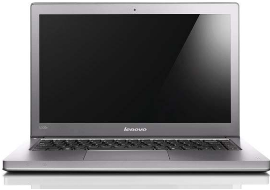
Lenovo IdeaPad U300e (Graphite Gray)