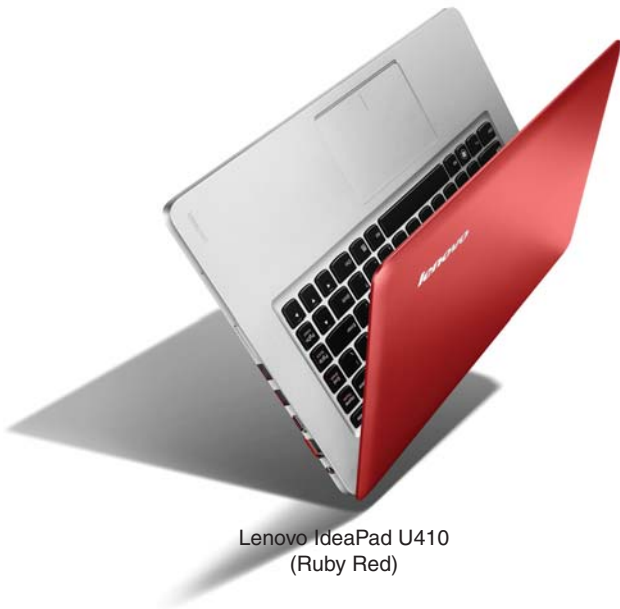
Lenovo IdeaPad U410 (Ruby Red)