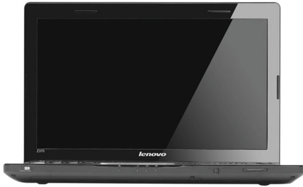
Lenovo IdeaPad Z370 (black)