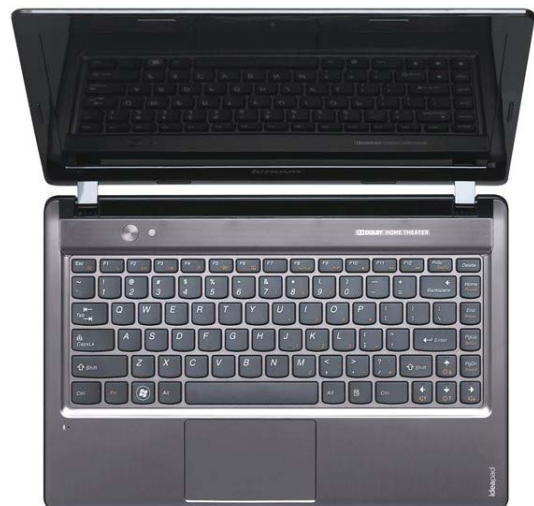
Lenovo IdeaPad Z380 (Graphite gray)