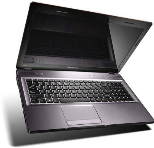
Lenovo IdeaPad Y570