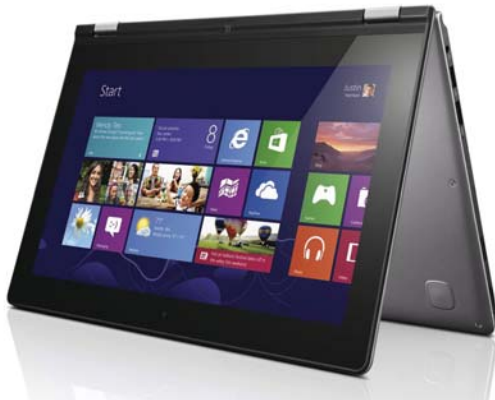
Lenovo IdeaPad Yoga 11 (Silver Gray)