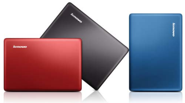
Lenovo IdeaPad U410