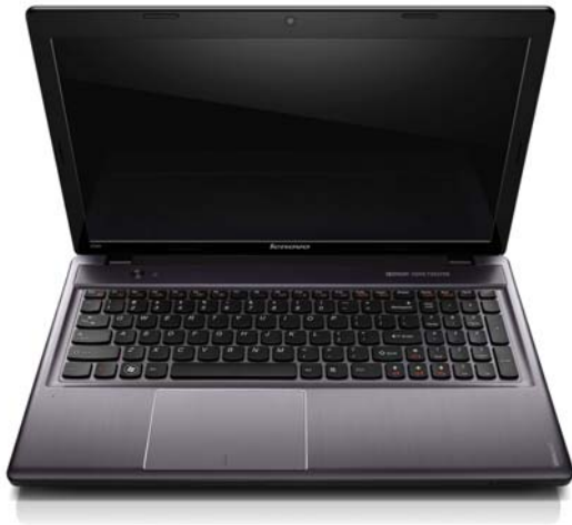
Lenovo IdeaPad Z580 (Graphite gray)