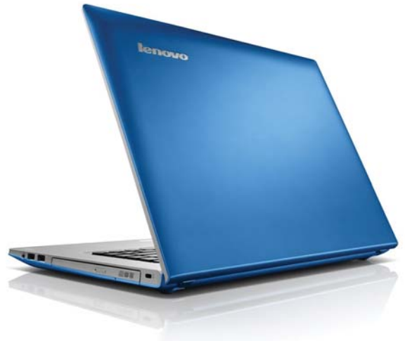
Lenovo IdeaPad Z400 (Blue)