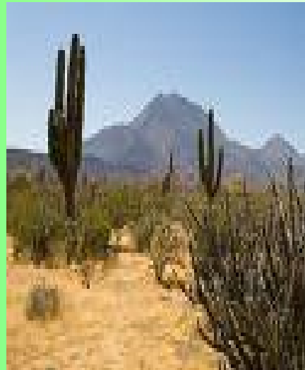
Personification in music

I can wait forever for you to open me you will not be disappointed you will not be disappointed