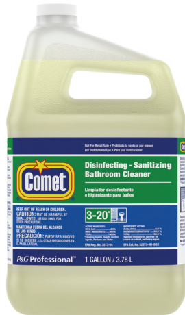
Ready To Use