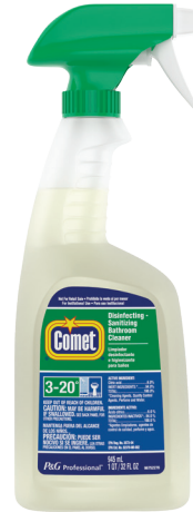
Ready To Use