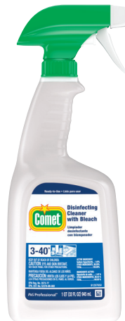
Ready To Use