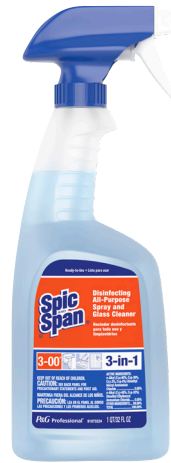
Ready To Use