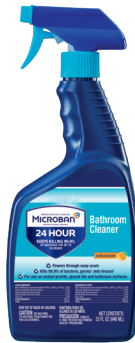
Microban® Professional Bathroom Cleaner