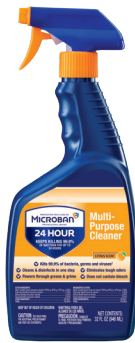
Microban® Professional Multi-Purpose Cleaner