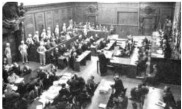
Nuremberg War Tribunal 1946/47: 24 managers of Hoechst, Bayer and BASF were indicted for mass murder, slavery and other crimes against humanity.

From "Arbeit macht frei" to "Codex Alimentarius"