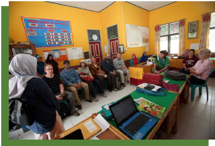
IPEWG members meet with members of the local community who are engaged in APRIL's Fire Free Village Program

IPEWG can assist APRIL in this implementation, but it is clear that delivering the Government of Indonesia's vision for peatland protection and management on the ground, while maintaining a viable long-term future for APRIL, will require an integrated, multi-stakeholder driven process.