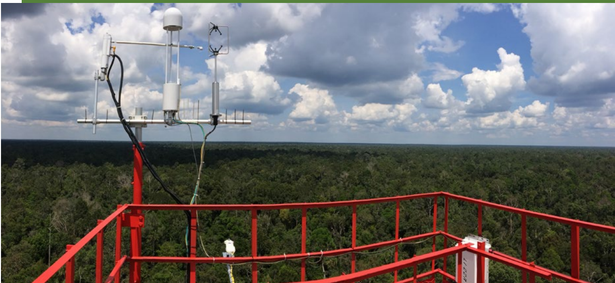
A view from the top of one of the flux towers in the Kampar Peninsula, Riau, Sumatra.