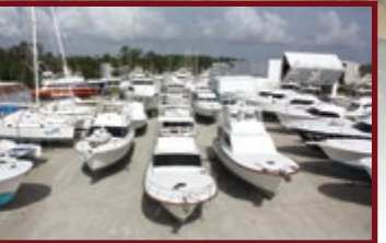
Hurricane Haulout Program