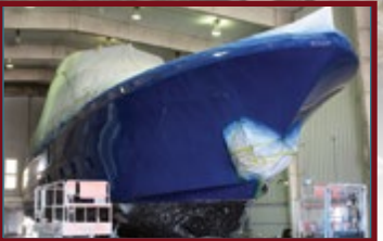
Indoor Paint Facilities