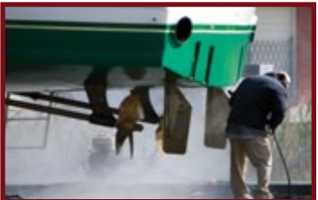
Bottom Jobs & Running Gear