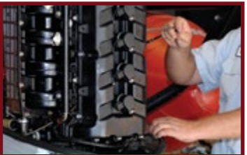
Inboard & Outboard Service