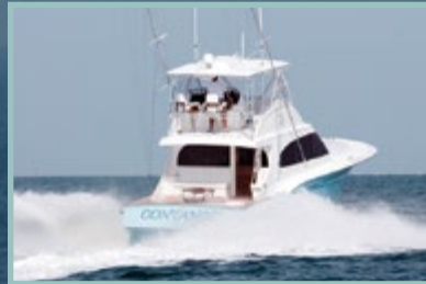
Pacific Coast Sportfishing Jarrett Bay Hull #30

"My Captain's run to Mexico got a bit dicey... He mentioned it was the best boat he has ever run in different sea conditions."