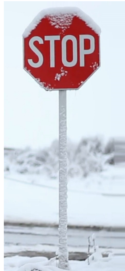
It is important to stop Receiving and Shipping and Freeze Inventory

Option B: For setup, each item is assigned a Cycle Class (A, B, C, etc.) then the user will filter on a Cycle Class to count.