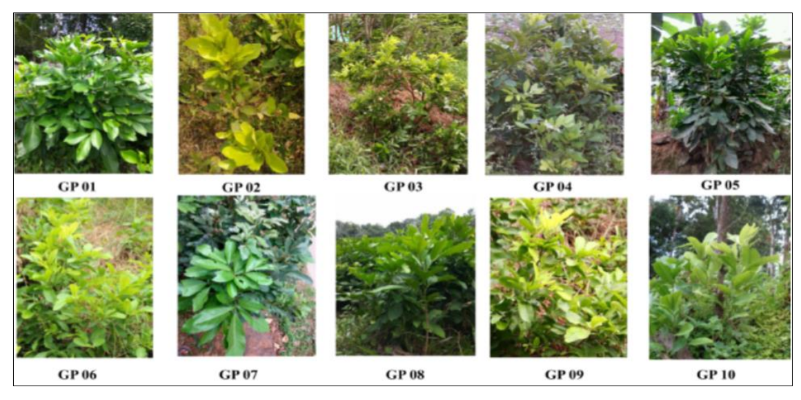
Fig 1: Habit of Glycosmis pentaphylla (Retz.) DC

leaves were attenuate at base and acute to round at apex of the leaf. Venation was reticulate in all the accessions. The length of the leaf was highest for accession GP09 ( 15.63\pm0.00 cm) and accession GP10 has the highest laminar breadth ( 6.44\pm0.00 cm). The leaves were glandular on both sides and glabrous for all the accessions.