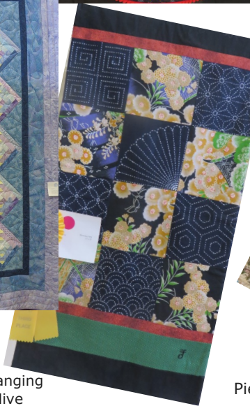
Deja Vu by Tere D'Amato