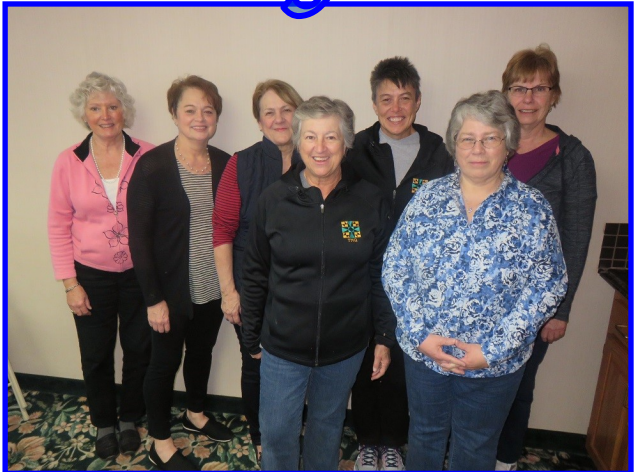
A happy group