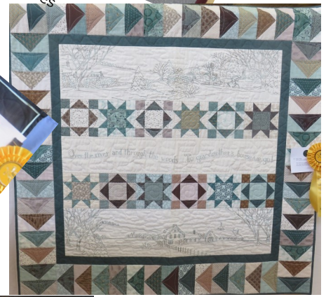
Over the River and Through the Woods by Midge Reed