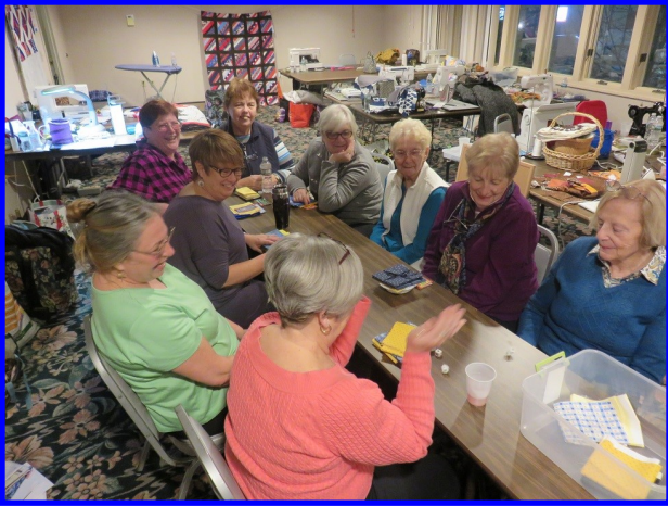
Fat Quarter Game