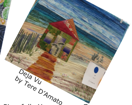
Piecefully Yours page 7