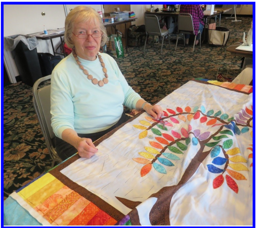
Piecefully Yours page 13