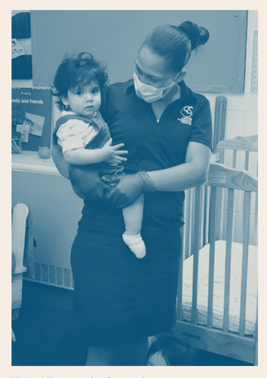
United Community Center in Milwaukee, Wisconsin

Prior to the pandemic, there were approximately 675,000 childcare providers in this country, predominately small businesses, who were already operating on thin margins.<sup>4</sup> At a minimum, it costs $1,230 per month to provide center-based care for an infant and $760 per month for a preschooler.<sup>5</sup> These costs represent a program that meets minimum state licensing standards and pays their workers industry-standard wages. Childcare is one of the lowest-paid professions in the United States; the average early childhood teacher makes just $10.72 per hour.<sup>6</sup> Even with low payroll costs, childcare centers need a minimum number of children enrolled in order to be financially sustainable. However, almost two-thirds of childcare centers are small businesses serving less than 75 children and are struggling to break even.<sup>7</sup>