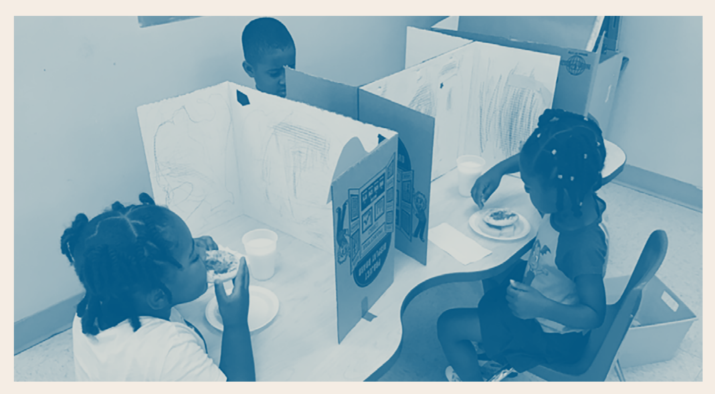
Wanda's Little Hands Educational Center in Raleigh, North Carolina