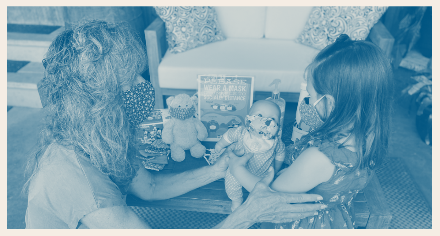
Mountain View Child Care in Troy, Vermont