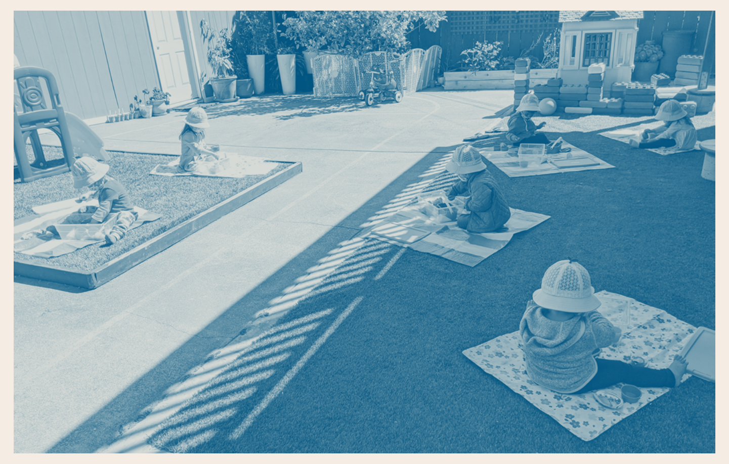
Modern Education Family Childcare in San Francisco, California

Local nonprofit childcare provider in Florida