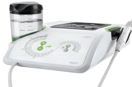
Fig 1: Piezosurgery Device

way of using piezoelectric device is with high speed with lower pressure; increased pressure results in increased vibration of the inserts [3]. In contrast to conventional drilling procedures; piezosurgery produces micro vibration and little noise, which minimizes patient's psychological stress and fear during osteotomy under local anaesthesia.