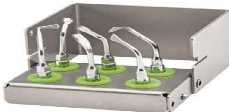
Fig 2: Piezosurgery Tips