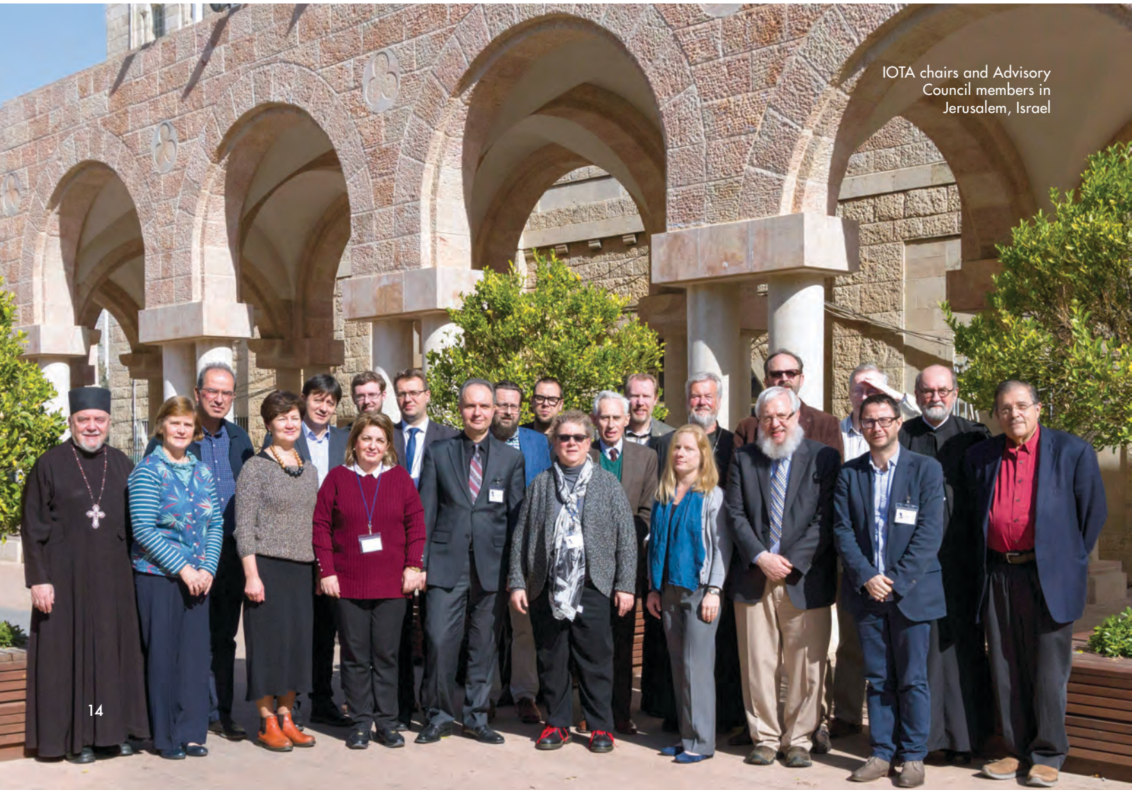
IOTA chairs and Advisory Council members in Jerusalem, Israel