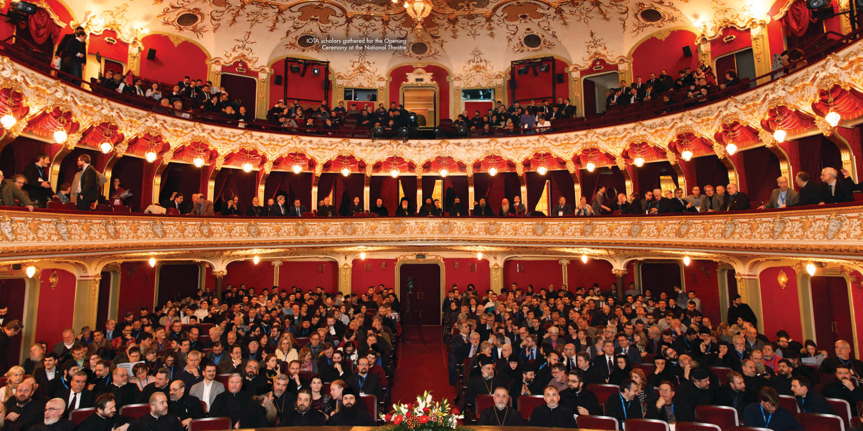
IOTA scholars gathered for the Opening Ceremony at the National Theatre