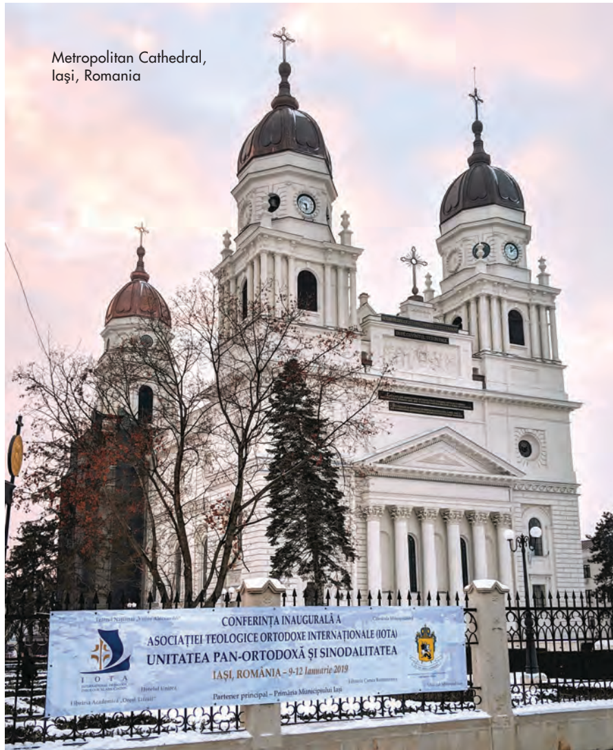
Metropolitan Cathedral, Iași, Romania