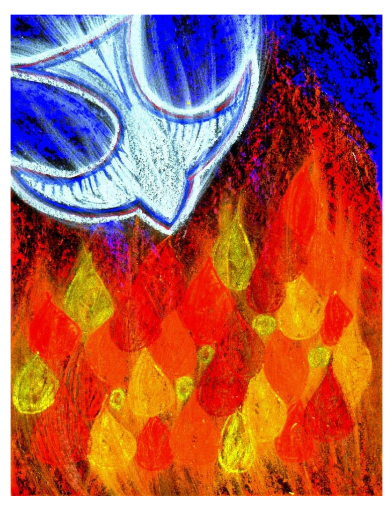
TO BE LOVING, SERVING, AND ACCEPTING OF ALL PEOPLE WITH GOD'S LIFE-CHANGING POWER AND GRACE