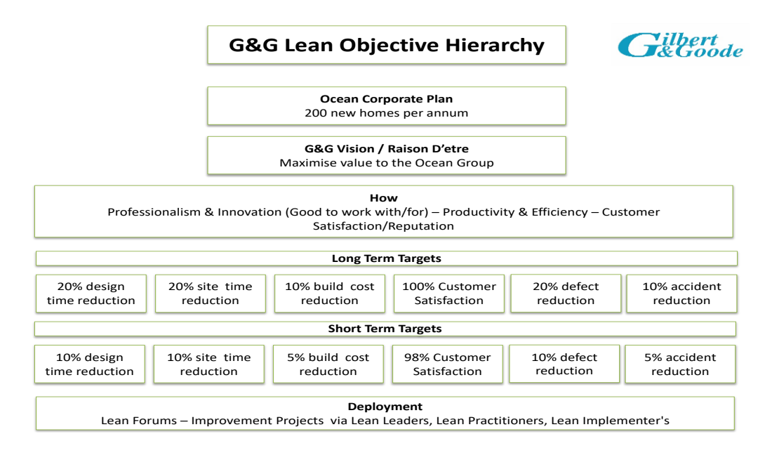
Figure 1. Lean Strategy Summary

A strategy was formed that clearly linked the lean improvement efforts back to the company's corporate strategy and metrics that could be tracked. This appears in Figure 1.