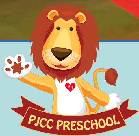
Meet Ari ("lion"), friend to all preschoolers