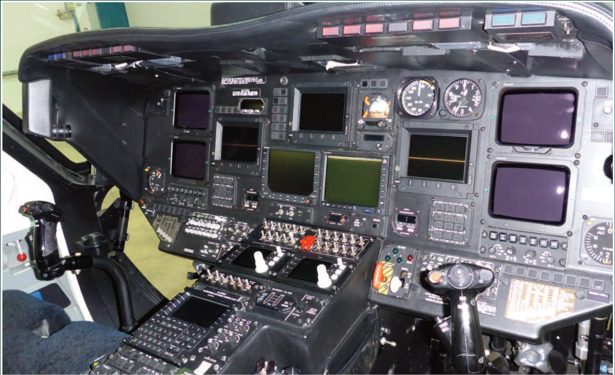
An integrated Instrument Display System (IIDS). Honeywell EFIS/ DAFCS: 4 tube Honeywell EDZ 756 EFIS with 5"x 6" Indicator.