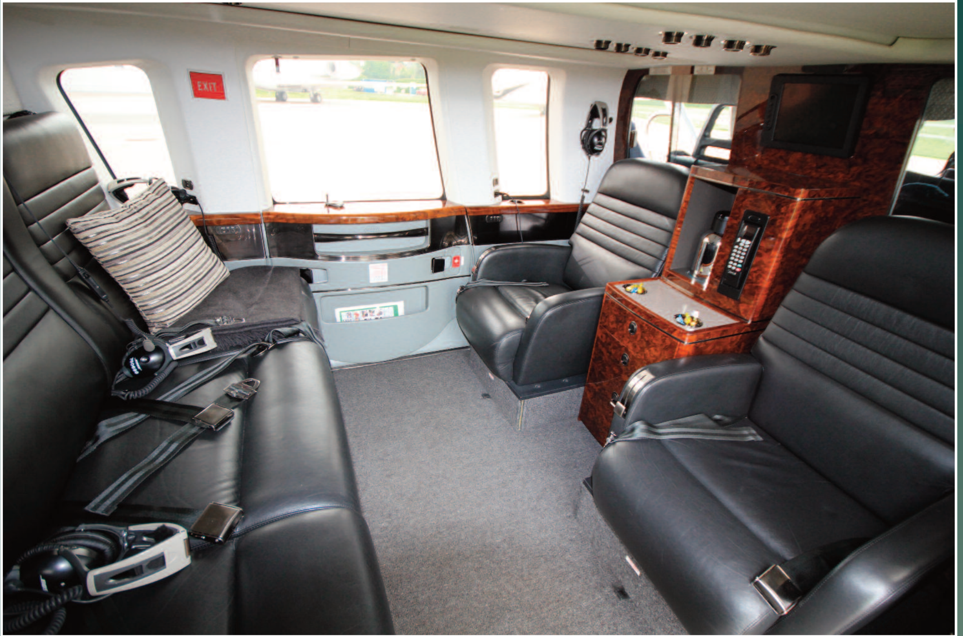
Deluxe VIP Interior. Dual Aft Facing VIP Deluxe Captain's Swivel-Reclining Chairs