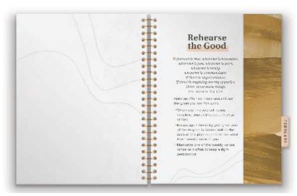
Laminated tabs with monthly devotional

NEW! Prayers to Share! Use these inspirational pass-along notes to uplift, encourage, and remind others of the beauty of God's hope!