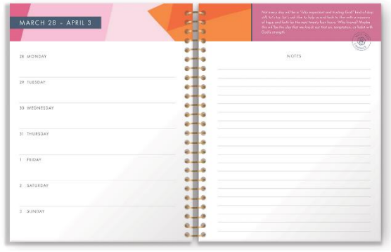
Weekly spread with full page for note taking