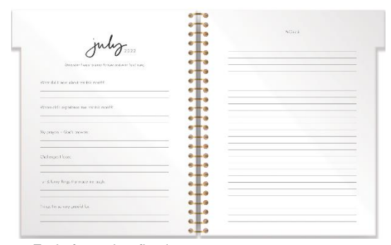
End of month reflection