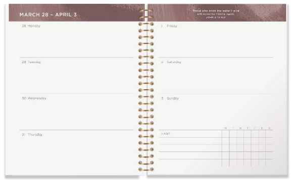
Weekly spread with habit tracker