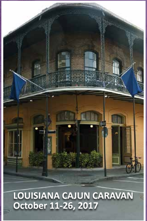
LOUISIANA CAJUN CARAVAN October 11-26, 2017

We also have many Chapter, State/Provincial and Region Rallies coming up. See the Calendar of Events for what is happening in your neck of the woods!