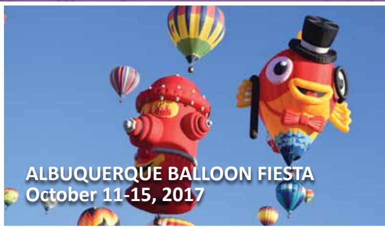
ALBUQUERQUE BALLOON FIESTA October 11-15, 2017