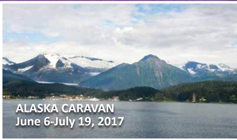
ALASKA CARAVAN June 6-July 19, 2017

PLANNING YOUR SUMMER AND FALL ADVENTURES? WE HAVE 3 SPECIAL EVENTS ALL SET AND READY FOR YOU. SEE INSIDE THIS ISSUE FOR ALL THE DETAILS!