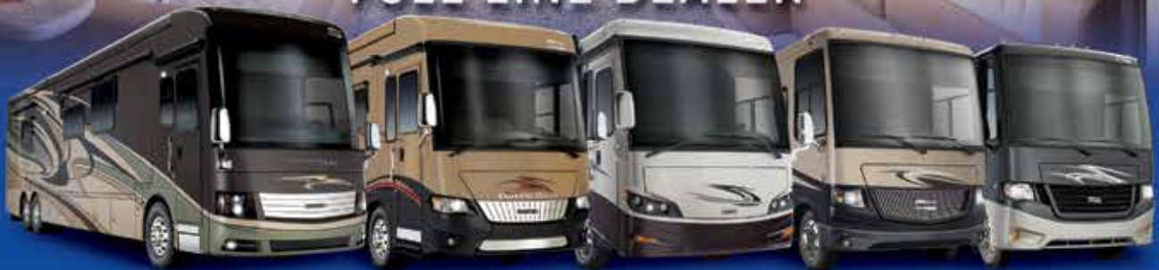
MOUNTAIN AIRE DUTCH STAR VENTANA CANYON STAR BAY STAR