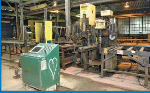
Controlled Automation Fabriline Model 3456-179 Automatic I-Beam Punch Line