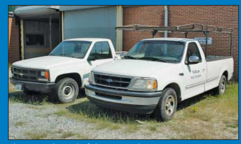
Chevy and Ford Pick-Up Trucks