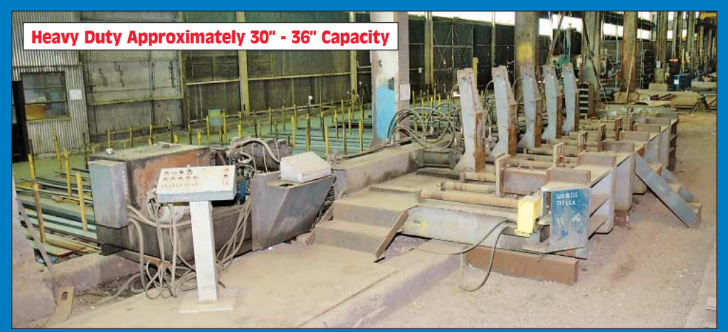
Hirschfeld Heavy Duty Five-Cylinder I-Beam Cambering Machine