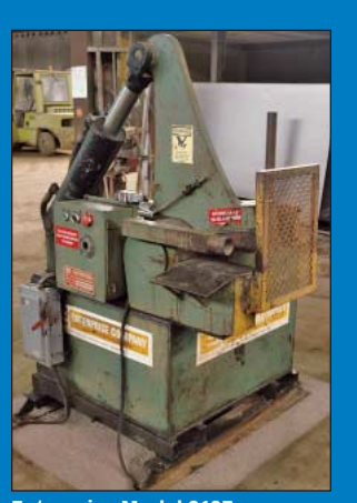
Enterprise Model 210E Hydraulic Alligator Shear