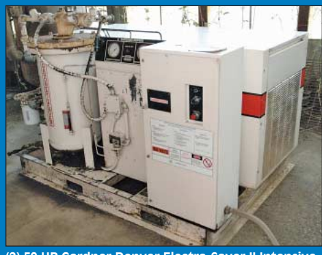
(2) 50 HP Gardner Denver Electra-Saver II Intensive Injection Rotary Screw Skid Mounted Air Compressors