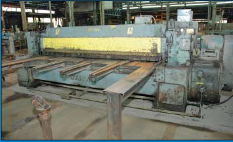
1/4" (Approx.) X 10' Wysong Mechanical Power Squaring Shear