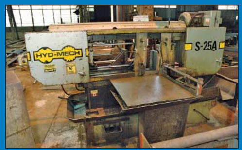
Hyd-Mech Model S-25A Mitre Base Automatic Horizontal Band Saw