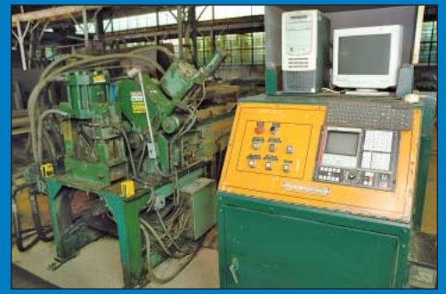
Peddinghaus Model APS-C21D Hydraulic Angle Shear and Punch Line