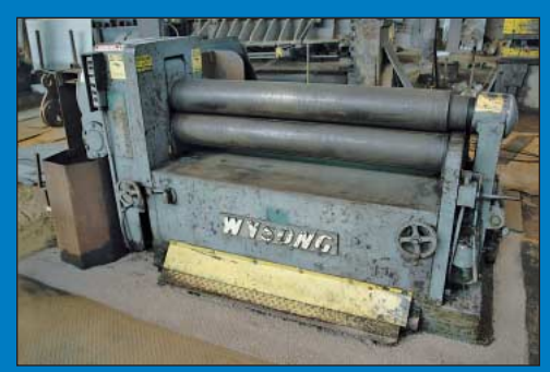
60" Wysong Initial Pinch Mechanical Power Plate Bending Roll