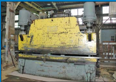
300 Ton X 12' Chicago Dries & Krump Model 300-VC10 Hydraulic Power Press Brake