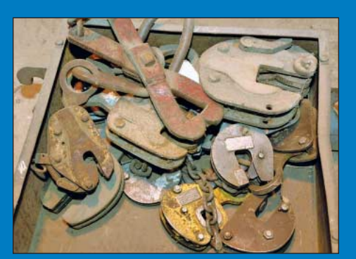
Partial View Numerous Plate Grabber Clamps and Related Material Handling Accessories