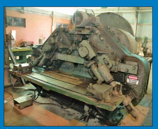
King Mechanical Bar and Angle Shear