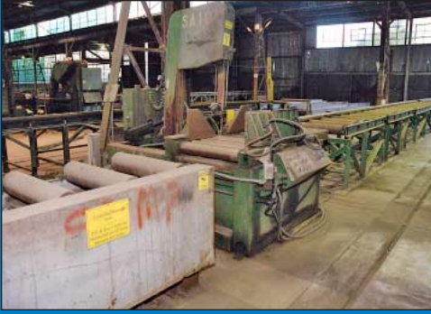
DoAll Model TF-25-SA Tilt Frame Vertical Band Saw