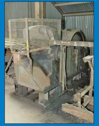
Canton Hill Acme No. 22A Flywheel Type Alligator Shear