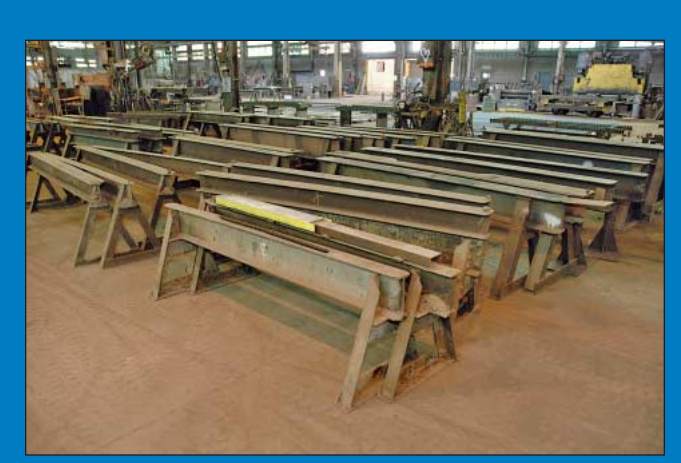
(50+) Heavy Duty Steel Sawhorses