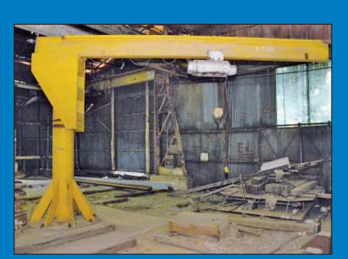
2 Ton X 16' Arm Floor Type Rotating Jib Crane

12% Onsite Buyers Premium 15% Online Buyers Premium