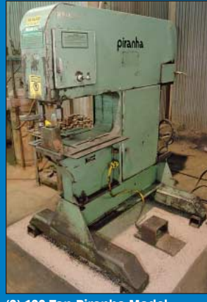
(2) 120 Ton Piranha Model SEP120 Single End Hydraulic Plate Punches