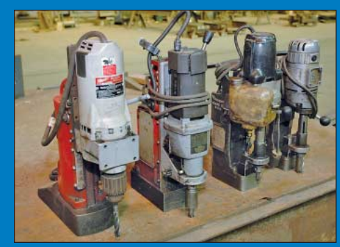
Numerous Magnetic Base Drills