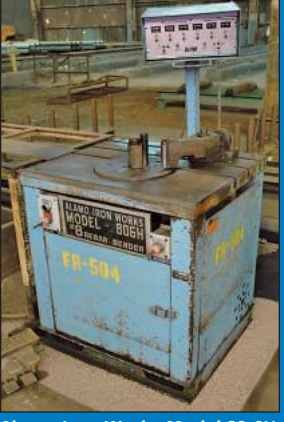
Alamo Iron Works Model 80-6H No. 8 Rebar Bender