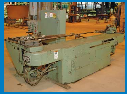
3/4" Pines Model M-725559 Horizontal Hydraulic Tube Bender

Large Quantity of Welding Accessories Consisting of; Approx. (50) Various Lengths Steel Horses, (6) H.D. Steel Welding Tables, Welding Clamps, Welding Wire and Rod, Vise Grip Clamps and Other Related Items