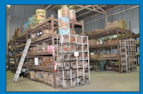
Partial View Large Maintenance Crib With Parts and Supplies