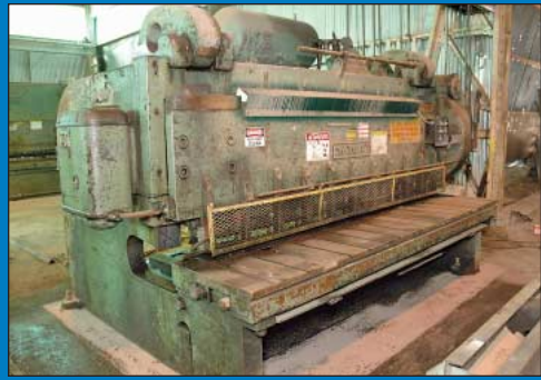
1/2" (Approx.) X 10' Cincinnati Mechanical Power Squaring Shear