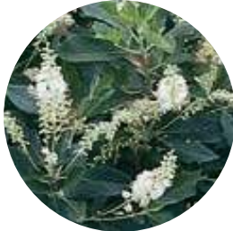
Dwarf Summersweet (2 - 4' H) Clethra alnifolia 'Hummingbird'