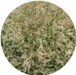
Switchgrass (2 - 2.5' H) Panicum virgatum 'Cape Breeze'