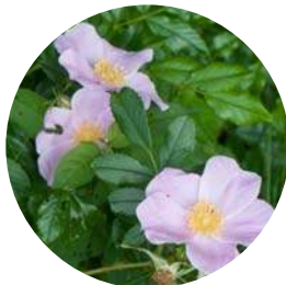
Pasture Rose (3 - 6' H) Rosa carolina