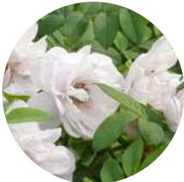
Dwarf Rugosa Rose (1.5 - 2.5'H) Rosa 'Schneekoppe' Snow Pavement