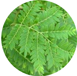
Skyline Honey Locust Gleditsia triacanthos var. inermis 'Skyline'