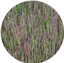
Little Bluestem (2 - 2.5' H) Schizachyrium scoparium 'Carousel'