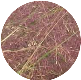
Purple Lovegrass (1 - 2' H) Eragrostis spectabilis