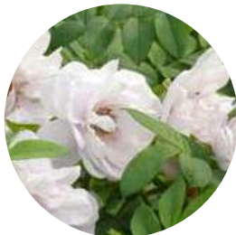
White Rugosa Rose (4 - 6' H) Rosa rugosa 'Alba'