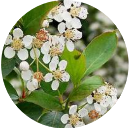
Dwarf Black Chokeberry (2 - 3' H) Aronia melanocarpa 'Iroquois Beauty'