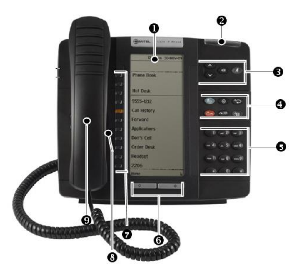
The 5320 IP Phone

The 5320 IP Phone supports Mitel Call Control (MiNet) protocol and session initiated protocols (SIP). It also supports Hot Desking and Clustered Hot Desking as well as Resiliency. The 5320 phone is ideal for executives and managers, and can be used as an ACD Agent or Supervisor Phone, as well as a Teleworker Phone.