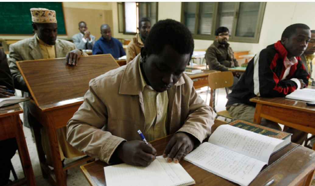
ISLAMIC STUDIES: The Islamic Call College in Tripoli, pictured here in February, has graduated about 7,000 students from 92 countries since opening in 1974.

scribes the Society as “the world’s foremost Islamic benevolent organisation with members from every corner of the globe.” Aides to the Anglican leader said they had no indications then or since that WICS was anything but a religious NGO interested in interfaith dialogue.