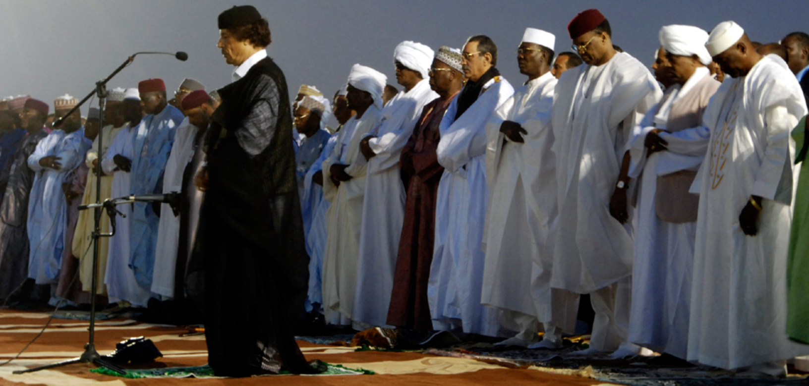
PLAYING IMAM: Libya's former leader Muammar Gaddafi leads mass prayers in Agadez, 2007.

The new Libya struggles with a twisted legacy: a Muslim humanitarian network that ran covert operations