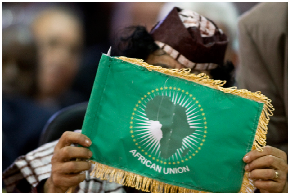
AFRICAN BROTHER: Gaddafi was presented on Libyan TV as a popular man in Africa. Here he examines the African Union flag at a summit in 2009.

How much these visits cost is not clear. A U.S. diplomatic cable from Mali, revealed by WikiLeaks, quoted an embassy source close to Gaddafi as saying Libya had paid up to $10 million for festivities during the