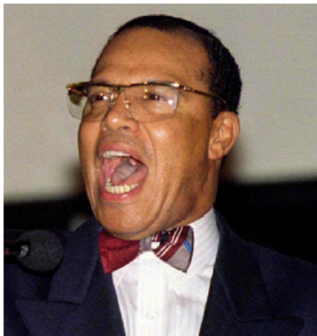
ALLY: Muslim preacher Louis Farrakhan, pictured here in 1997, said in March 2011 Libya had lent the Nation of Islam $8 million over the years and defended 'Brother Gaddafi'. A memo that month suggested the WIPL helped