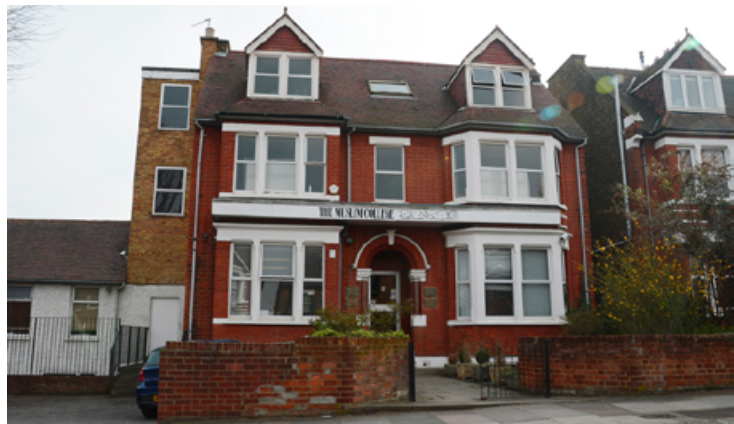
BRANCH COLLEGES: The Society employs around 2,000 teachers. Pictured here, the Muslim College in London, which it has financed