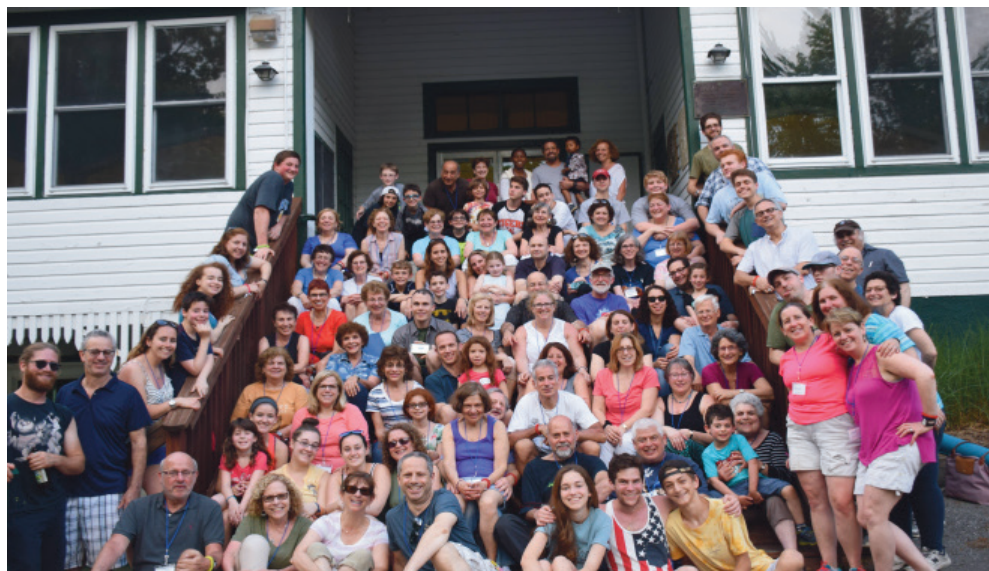
2016 KOL AMI RETREAT