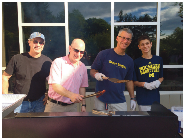
VOLUNTEERS COOKING AT THE COACHMAN BBQ