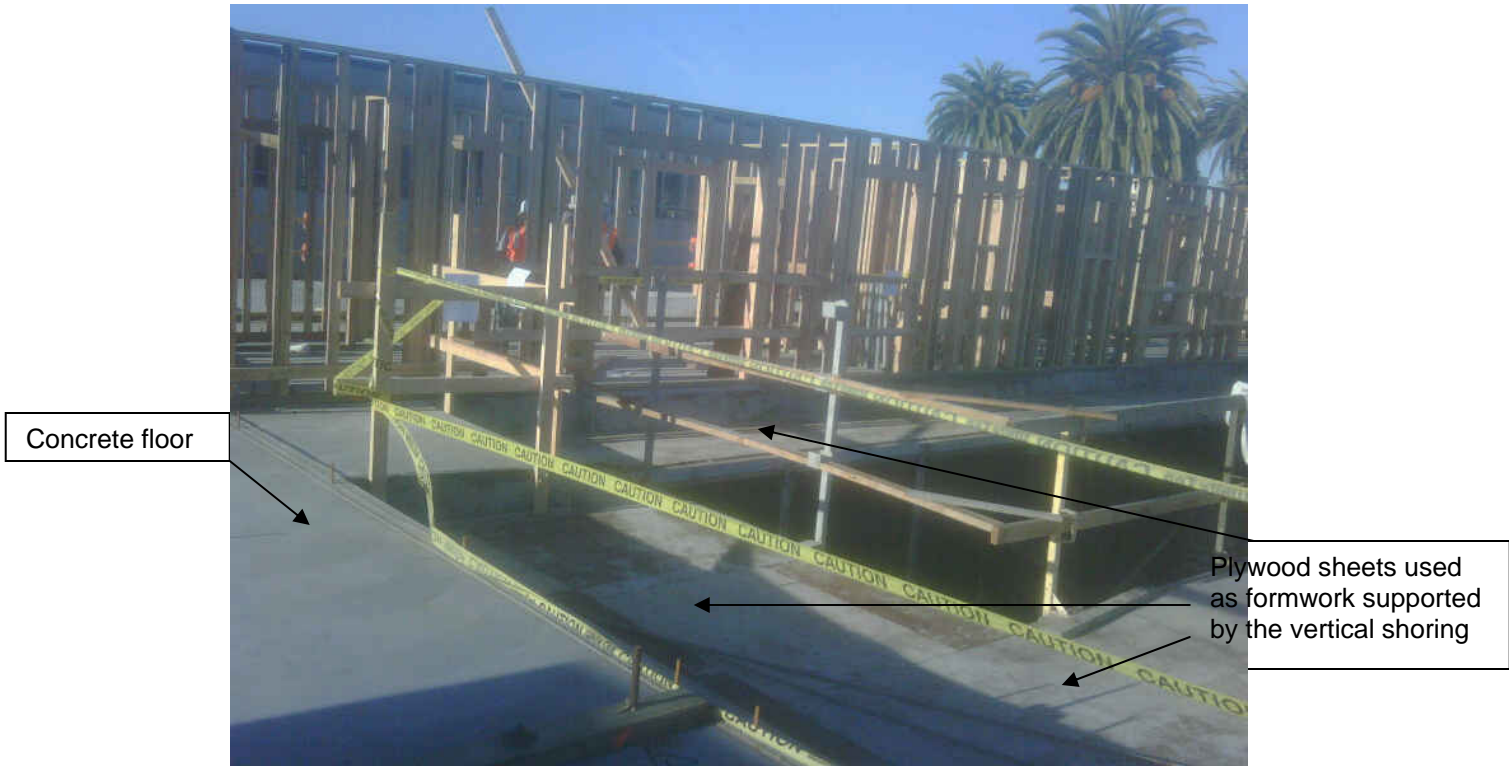
Exhibit 3. The second floor and shoring.