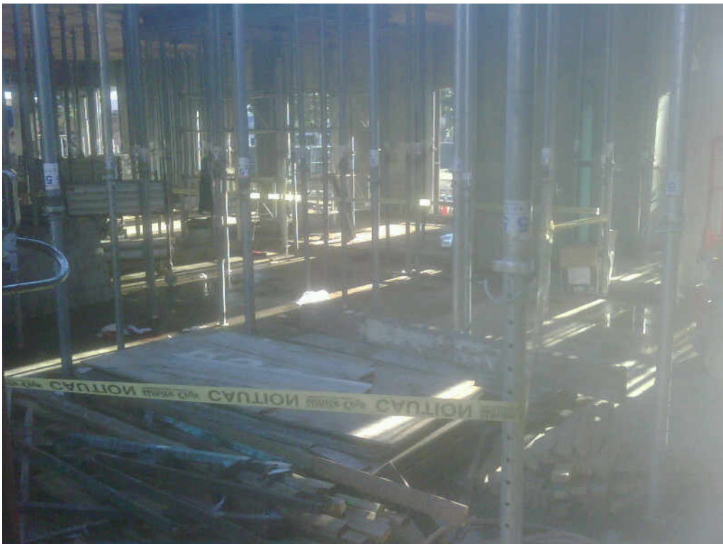
Exhibit 5. The vertical shoring and the support post.