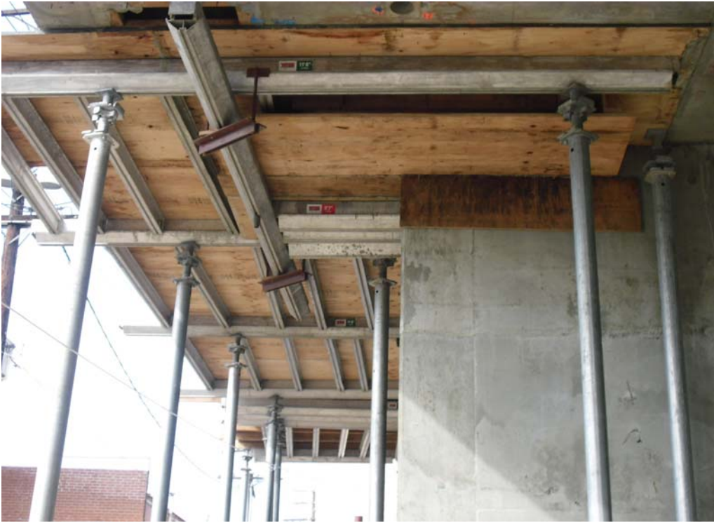
Exhibit 2. The vertical shoring from underneath.