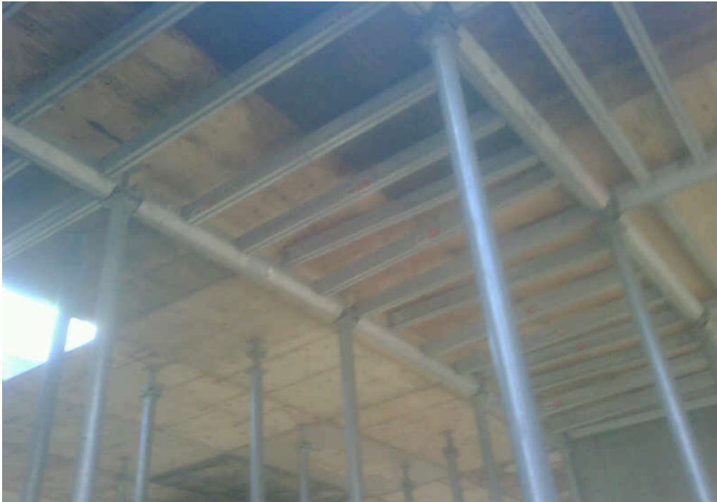
Exhibit 6. The vertical shoring showing the main and secondary beams that held the plywood in place.