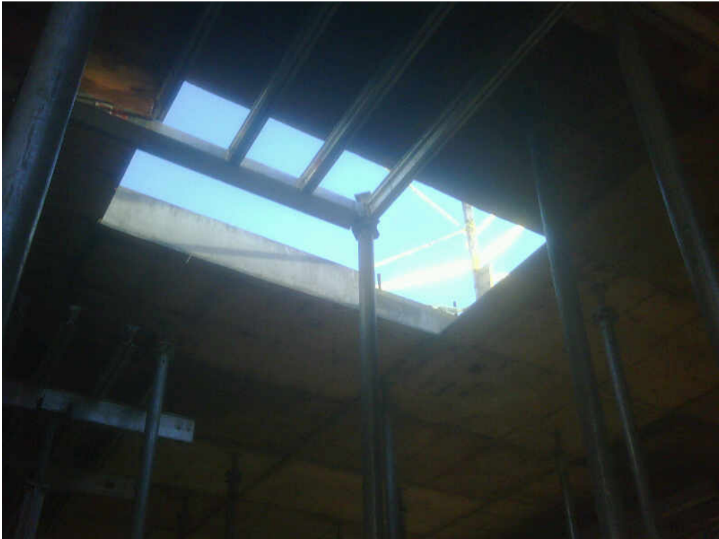
Exhibit 4. The hole the victim fell through.