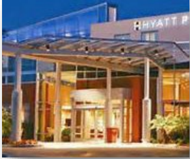
Hyatt Place Sarasota/Bradenton Airport