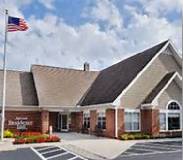
Residence Inn Sarasota/Bradenton Airport