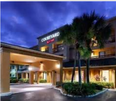
Courtyard by Marriott Sarasota/Bradenton Airport