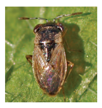
Adult big-eyed bug.