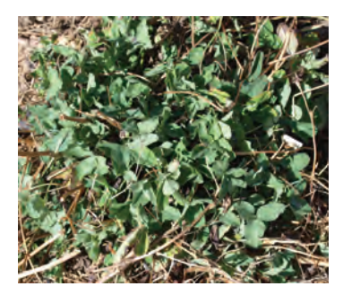
Clump-forming red clover ( Trifolium pratense ) can provide overwintering habitat for beneficial insects.

Many beneficial insects overwinter in the adult stage in the top layers of soil, in plant litter, or under the rough bark of trees. The value of providing a permanent (or semi-permanent) area of such overwintering habitat has not been extensively researched, but is something to consider. A strip of clump-forming perennial clover (e.g., Trifolium pratense ), perhaps in combination with a native bunch grass such as sideoats grama ( Bouteloua )