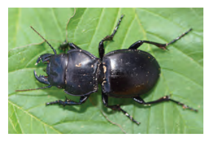
Adult ground beetle. Note large mandibles.