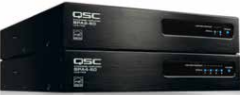
SPA2-60 and SPA4-60

The SPA Series are half rack 1U, convection cooled power amplifiers, delivering two or four channels of 60 watts per channel into 4Ω and 8Ω. These amps can also be bridged to supply 250W per channel pairs into 70V or 100V making them extremely flexible for Low-Z or High-Z applications. Utilizing an advanced Class-D amplifier design and Universal Power Supply, the SPA Series are amazingly efficient, allowing them to be convection cooled and ENERGY STAR® qualified with quiet auto-ramp standby functionality. The SPA2-60 and SPA4-60 are housed in an unobtrusive 1/2 RU chassis with unique mounting hardware enabling rack, table and wall mounting capabilities.