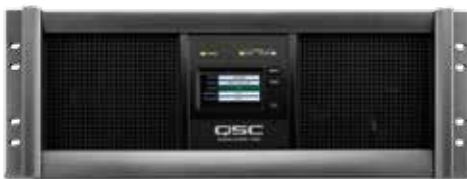
Core 1100 / 3100

Q-SYS™ Core 250i/500i Integrated Cores bring the power of the larger Q-SYS Cores to medium-sized applications. Integrated Cores can accommodate up to eight internal Q-SYS input and/or output cards for a total onboard channel capacity of 32 channels (or more if AES, Dante CobraNet™ cards are used) and up to 256 network channels. Channel count may be further expanded by the addition of Q-SYS I/O Frames and other peripheral devices.