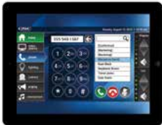
iOS App Controller