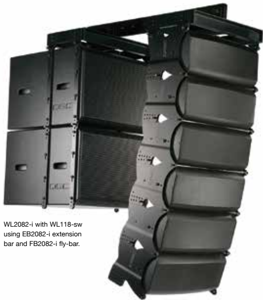
WL2082-i with WL118-sw using EB2082-i extension bar and FB2082-i fly-bar.

Designed for installation applications while retaining the performance of high-end touring line array systems, the ILA System v2 takes this concept and builds on it by offering a complete and accessible solution consisting of processing, amplification, line array, subwoofer and suspension accessories. Built around the WL2082-i line array element, the system offers both flying (WL118-sw) or ground-stacked (GP118-sw) subwoofer options.