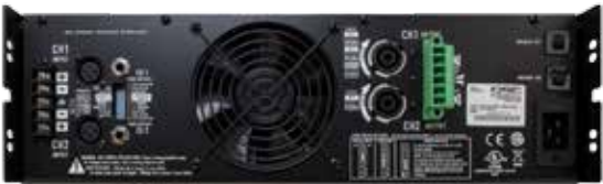
CMX 2000Va (3RU Models)