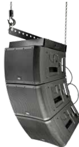
KLA AF12 Array Frame