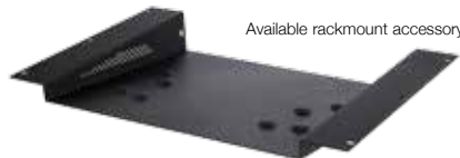
Available rackmount accessory

The TouchMix Series models are completely self-contained and require no external PC or video display. The graphic, color touch-screen provides access to all mix parameters along with a physical rotary encoder and hardware buttons. The available Remote Control App for iOS phones and tablets controls all mixer parameters and the included USB Wi-Fi adapter creates the network connection between the mixer and the hand-held device. While no additional hardware is required, wired or wireless connection to an external or infrastructure router is also supported. The mixer is also capable of direct, multi-track recording to an external USB hard drive in 32-bit broadcast wave format. Tracks can be mixed down or played back on the mixer or imported into most DAW software for over-dubs and post-production.