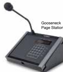
Gooseneck Page Station

Used in conjunction with a local control interface (TSC-3 or UCI Viewer), an I/O-22 plus a microphone of choice emulates the functionality of the models listed above.