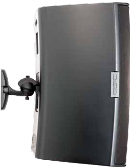
AD-S10 with patent-pending X-Mount™ mounting system