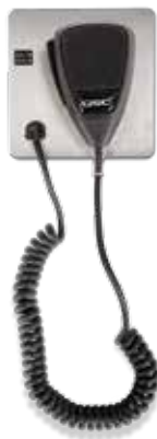
PS-X Paging Accessory