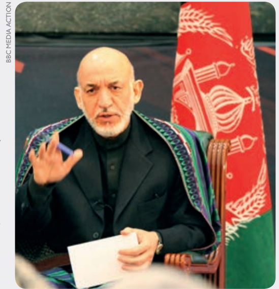
Above Afghan President Hamid Karzai takes questions from the audience on the BBC Media Action debate programme Open Jirga (Open Assembly). BBC Media Action has been supporting Radio Television Afghanistan (RTA) to produce editorially balanced public debates.

The apparent popularity of Open Jirga may in time lead to other broadcasters investing more of their own resources in similar public debate programmes capable of bringing diverse communities together.