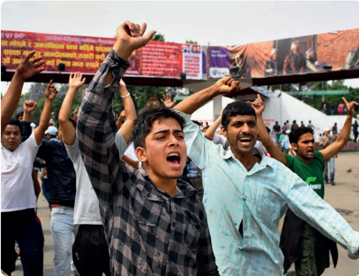
Left Fragile states are often fractured states, divided along religious, political, ethnic or other factional fault lines. In this image from Kathmandu, protestors support a strike called by the Unified Communist Party of Nepal (UCPN) to remove the ruling government.