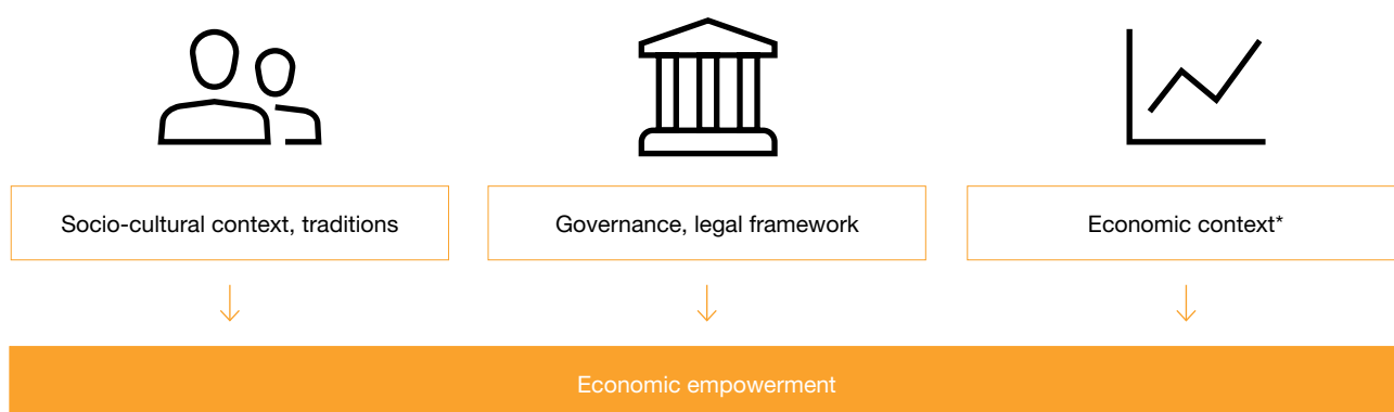
Figure 1 Women's economic empowerment

* Economic activity rates, employment/unemployment, access to credit