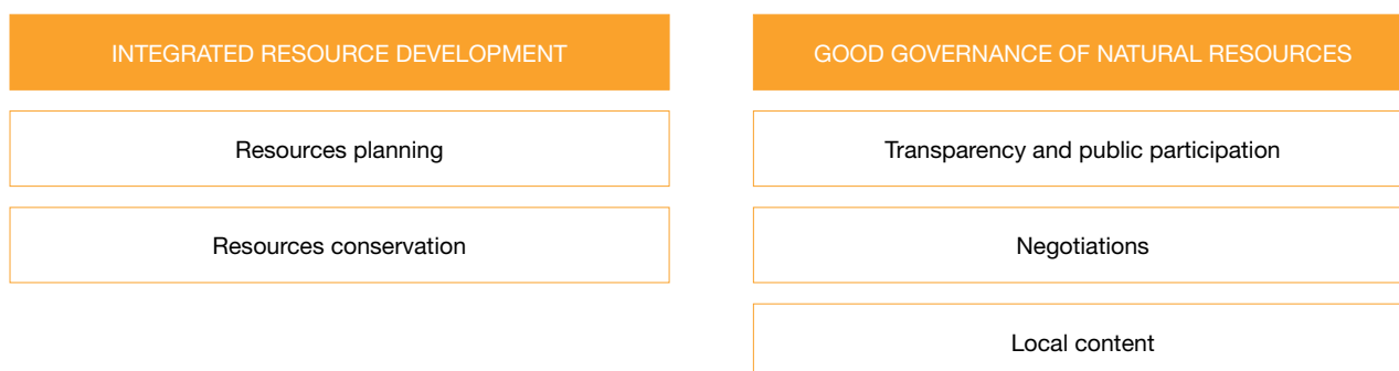
Diagram 1 African Natural Resources Center strategic pillars

The Bank, through its Agriculture Transformation Strategy, recognizes the important role that land policies will play in achieving its goals. Among others, the Bank acknowledges the need to assist regional member countries (RMCs) in creating an enabling environment and conditions through inclusive land policies that balance the needs of different users. This role is captured in the “Agenda for Transformation”, which requires addressing seven areas, including creating an enabling agribusiness environment with appropriate policies and regulations.