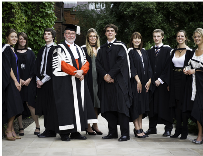
Graduates meeting the Vice-Chancellor.

Find out more about our admissions process and who to contact if you need help with your application.