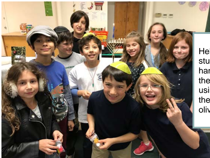
Hebrew School students with the hanukkah they and their classmates lit using olive oil that they made with an olive press.

So, to me, it's not, "if you build it, they will come." It's, "if we all build it together each week, then we'll already be there ... for each other."