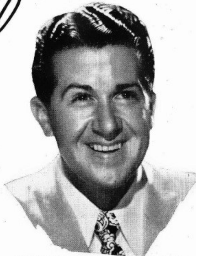
EDDY HOWARD AND ORCHESTRA