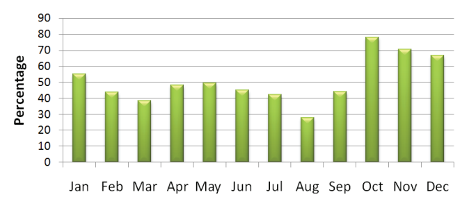
Fig. 2. Report of the flow relative to the nominal capacity -2013.

reached, such peak loads should be absorbed by the WWTP without any problem.