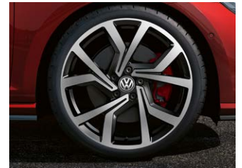
Brescia 18" alloy wheels (Optional on GTI)