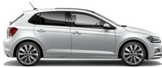
White Silver Metallic