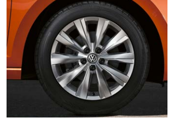
Las Minas 16" alloy wheels (Standard on Highline)