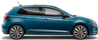
Reef Blue Metallic