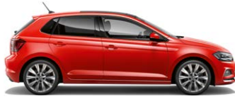
Flash Red Non-Metallic