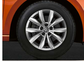
Salou 15" alloy wheels (Standard on Comfortline)