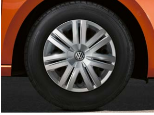
14" steel wheel cover (Standard on Trendline)