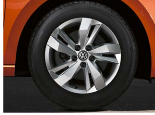
Sassari 15" alloy wheels (Optional on Comfortline)