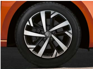
Torsby 16" alloy wheels (Included in beats Package)