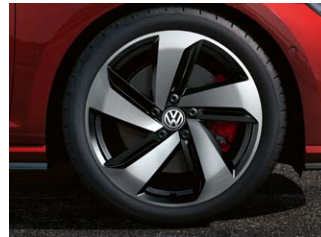
Milton Keynes 17" alloy wheels (Standard on GTI)