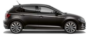
Limestone Grey Metallic