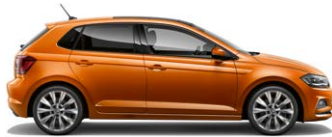
Energetic Orange Metallic