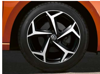
Bonneville 17" alloy wheels (Included in R-Line Package)