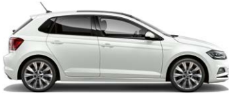
Pure White Non-Metallic

The illustrations on this page can only be regarded as a general guide as the printing process cannot render the true depth and brilliance of the paint finishes with absolute accuracy. Please note that certain paint and trim combinations may not be available.