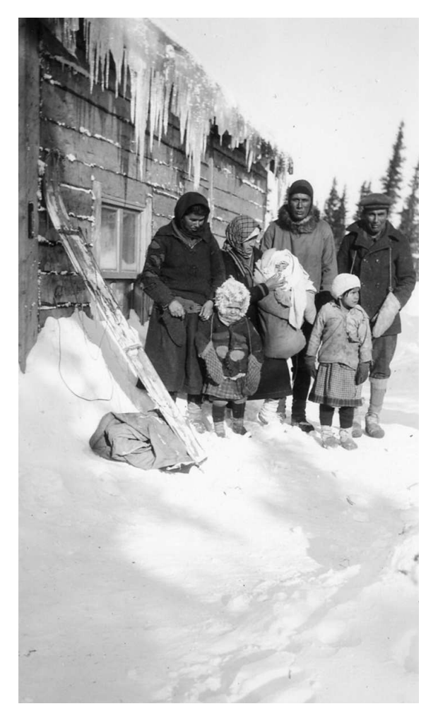
Vieux Comptoir – 8 lutego 1938