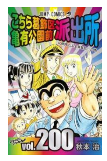
Kochira Katsushika-ku Kameari Koen Mae Hashutsujo, which ran for four decades, ended with the 200th volume, gaining many fans along the way. (c) Osamu Akimoto, Atelier Biidama/Shueisha

As of 2017, NARUTO, a manga serial in the Shonen Jump magazine, in which the main character is a ninja boy, has been republished in book form and distributed in more than 30 countries. The animated version is on the air in more than 80 countries. Another major manga series in the Shonen Jump magazine is ONE PIECE, an ocean adventure story with a pirate boy as the main character. Having spawned an animated television series, films, and games, ONE PIECE has been distributed in more than 35 countries and regions. The magazine has produced another series which has gained global recognition. Kochira Katsushika-ku Kameari Koen Mae Hashutsujo is a gag manga featuring police officer Ryotsu Kankichi and many unique characters, which was serialized between 1976 and 2016. With the publication of the 200th volume, the series received the Guinness World Record for "Most volumes published for a single manga series." Japanese manga and animation have clearly expanded beyond their original group of hardcore fans to become a significant part of Western pop culture as a whole.