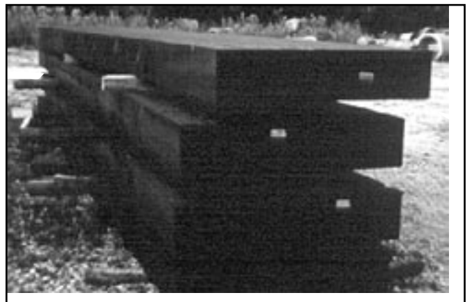
Figure 1. Typical glulam bridge deck panel.

Glulam deck panels are constructed of different sizes of southern pine dimension lumber (2 by 8 through 2 by 12) that is finger-jointed and face-glued into a solid bridge deck panel or bridge girder. Modern glulam manufacturing plants can produce timbers in virtually any size and shape. However, for these types of bridge decks, panels are typically 4 to 6 feet wide and 6¾ to 10½ inches thick. Lengths of these panels can range from 15 to 40 feet, with the longer lengths requiring the greatest panel thickness. A typical glulam deck panel is shown in Figure 1.