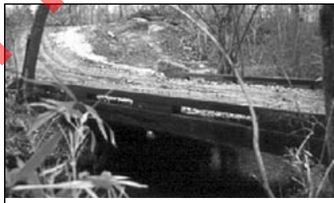
Figure 6. Finished bridge installation.

The time required to install the glulam bridge is about 6 hours. After the crossing is no longer needed, the bridge can be removed in reverse order of the installation. Removal time is approximately 3 hours. There may be some