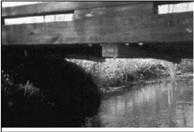
Figure 3. Transverse stiffener beams attached to bridge deck panels.

The stiffener beams are also made of creosote treated glulam beam 6¾ inches wide by 5½ inches thick by 16 feet long.