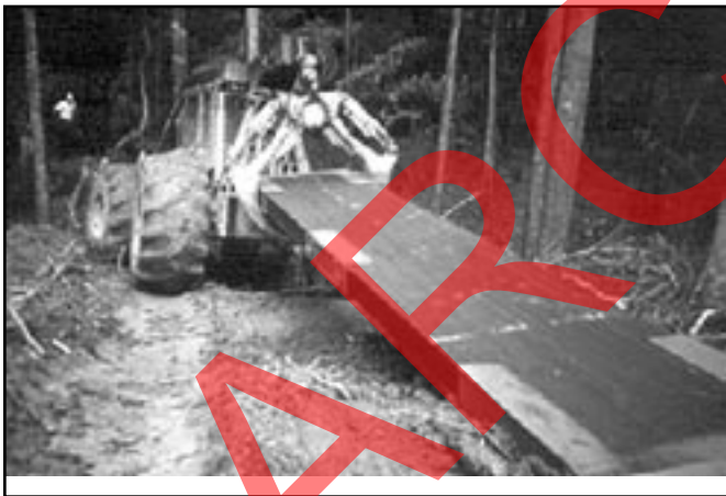
Figure 2. Use of grapple skidder to place glulam bridge

Through research at Auburn University, several variations of these types of bridges have been designed and tested. These include bridges for off-highway vehicles such as log skidders as well as several different types of bridges for log truck traffic. The lengths of these bridges range from 26 feet for the skidder bridge up to 40 feet for the largest truck bridge. The skidder bridge is the simplest design and consists of two glulam panels 4 feet wide by 26 feet long by 8½ inches thick. The two panels are laid side-by-side directly on the stream banks with a gap approximately 2 feet wide between the panels. To simplify the installation and removal, the panels are not connected to each other. The panels are skidded to the stream crossing site by the skidder and then they can be easily set in place using the skidder grapple as shown in Figure 2.