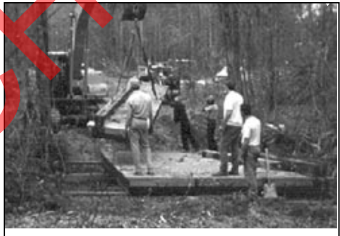
Figure 4. Placing bridge deck panels.

Installation of the bridge usually requires some site work with a bulldozer or excavator. You want to try to get the floor of the bridge as level as possible, so it is best to use a construction or engineer's level to insure that the sills are at the same elevation before you set the first panel in place. The panels can then be lifted into place with a knuckleboom loader, backhoe, or crane truck using nylon slings, chains, or wire rope as shown in Figure 4.