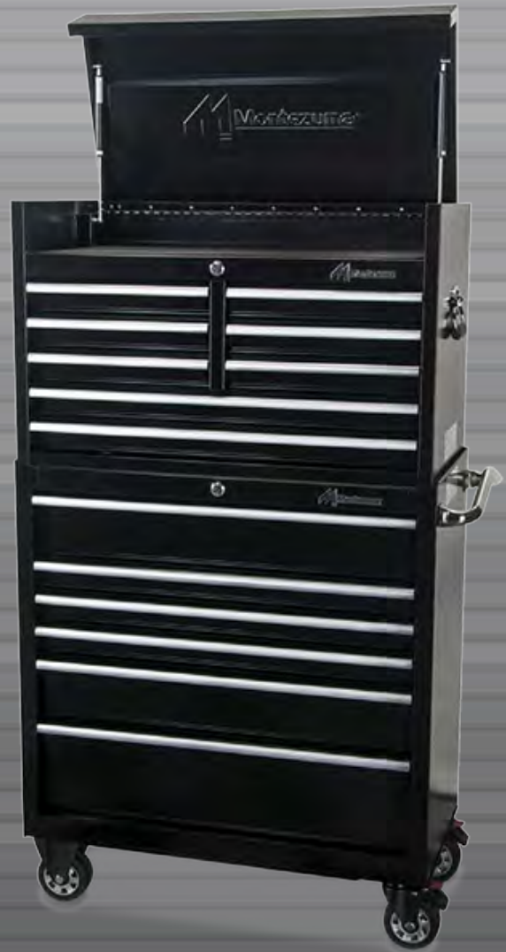
BK3608CH - 36" 8 DRAWER TOP CHEST