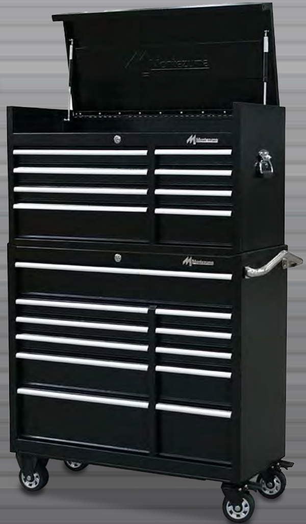
BK4108CH - 41" 8 DRAWER TOP CHEST