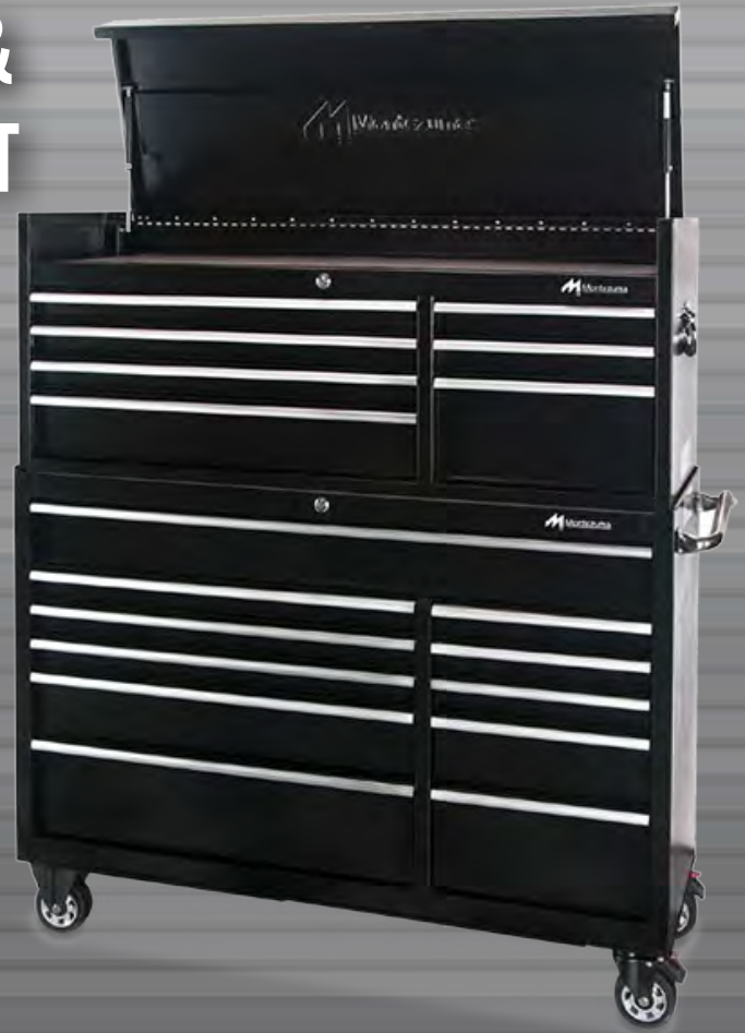
BK5607CH - 56" 7 DRAWER TOP CHEST