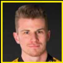
Nico Hülkenberg + Daniel Ricciardo