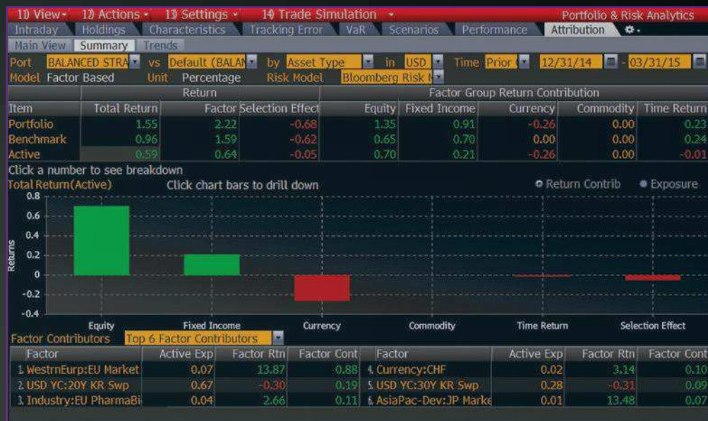
PORT <GO> - Factor-Based Attribution Analyze the sources of your portfolio's historical performance based on Bloomberg's multi-factor risk models