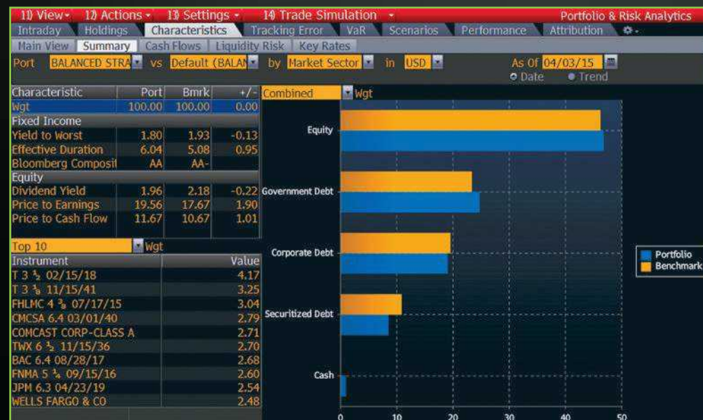
PORT <GO> - Characteristics tab Analyze the fundamental characteristics of your portfolio that matters most

yield for equity portfolios or effective duration for fixed-income portfolios. Create your own growth or trend metric leveraging Bloomberg's vast fundamentals database.