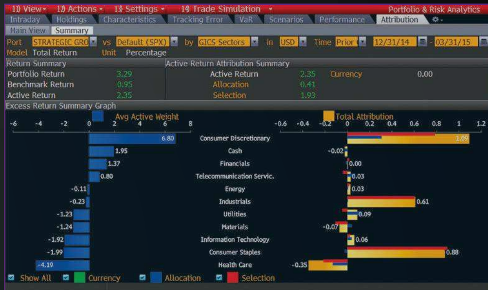
PORT <GO> - Performance Attribution Understand the sources of your portfolio's historical performance based on sector and security bets