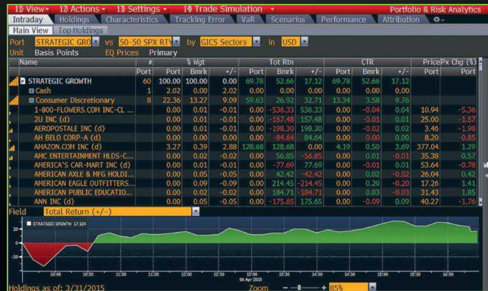
PORT <GO> – Intraday Performance Monitor your portfolio's intraday performance relative to the prior day's close prices

identify today's top and bottom return contributors. Keep track of your portfolio's performance even when you are out of the office by running Bloomberg Anywhere on your mobile device.