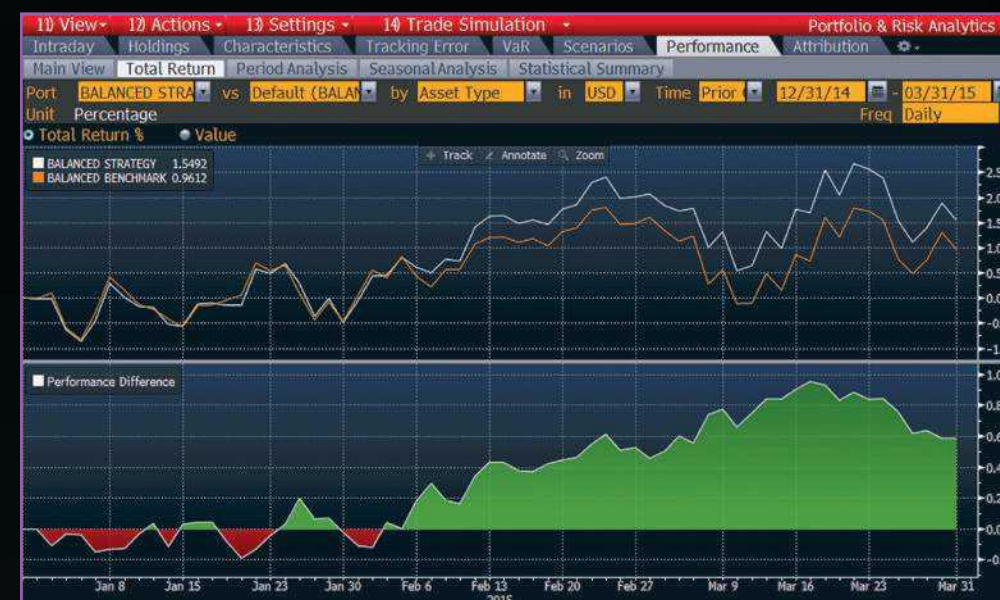
PORT <GO> – Performance See how your portfolio has performed over time on an absolute basis or relative to your benchmark

sources of your portfolio's absolute or excess return by asset class, sector, geographic region, a custom classification, and even based on Bloomberg's multi-factor risk model.