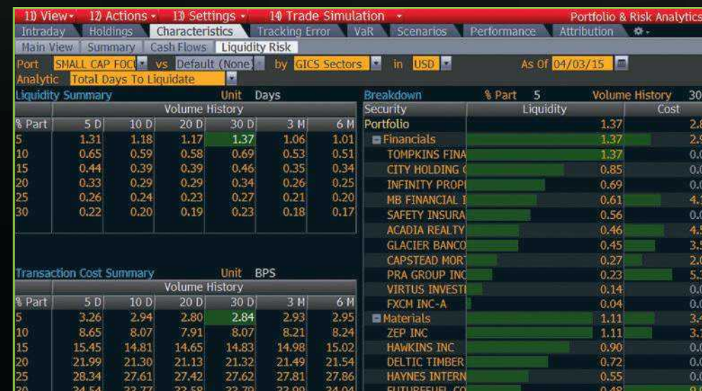
PORT <GO> - Liquidity Risk Analyze your equity portfolio's structure in terms of the overall liquidity of your positions