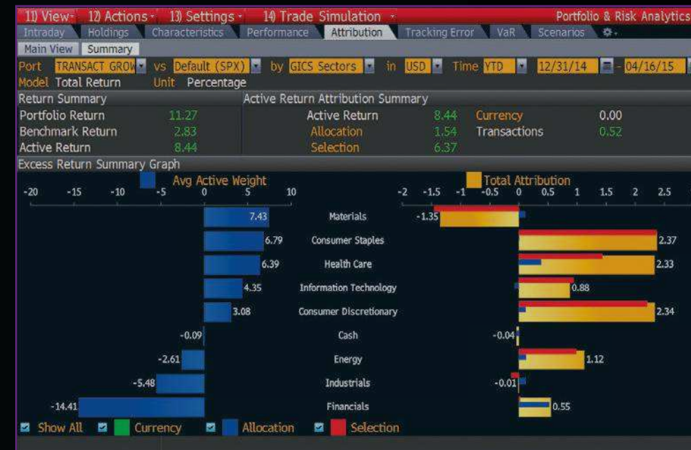
PORT <GO> - Transactions-Based Attribution Understand how your transactions and transacted price levels impacted the portfolio's total return over a historical time period