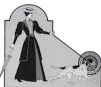
Portland Kennel Club, Inc.